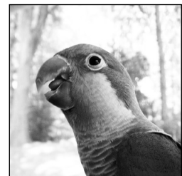
Monk parakeet.

The invasive monk parakeet ( Myiopsitta monachus ) is causing problems in Edgewater, New Jersey. There are an estimated 200 to 230 monk parakeets in Edgewater, up from about 190 birds in the past 3 years. The parakeets pose a threat to native species, damage agricultural crops, and their habit of nesting in electrical transformers has made them a menace in some quarters. The Public Service Electric and Gas Company (PSE&G) cracked down on the birds by tearing down their nests, even during the breeding season. PSE&G maintained that the nests were a potential fire hazard. Any fight to remove the colorful birds, however, will be a tough battle.