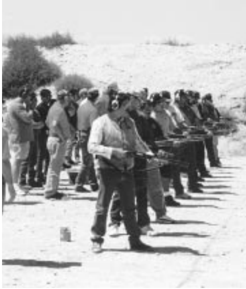
Nature's caretakers. Tribal conservation law enforcement agents practiced shooting under the watchful eye of Service instructors at recent training held in Montana.

It was far from your typical classroom scene—but then this wasn't your typical classroom.