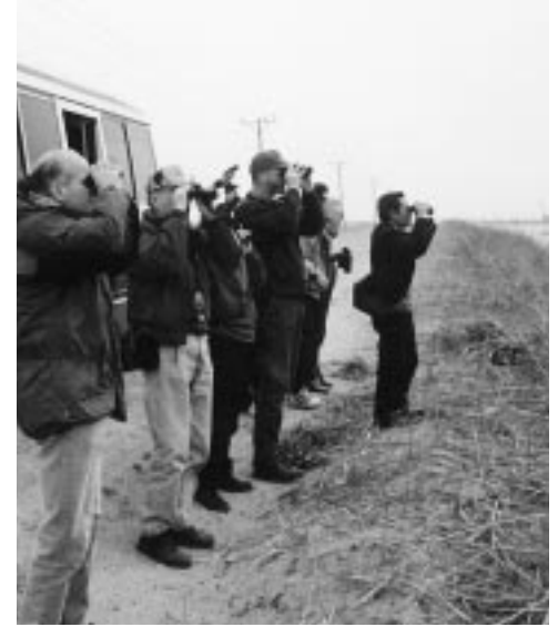
Taking in the scene. Members of the Service's International Conservation Corps and their Chinese counterparts survey coastal marshes near Panjin, Liaoning Province, near the Yellow Sea, where wetlands also contain oil wells and agricultural developments.

The delicate Monarch butterfly overcomes incredible odds on its annual journey from the United States to Mexico and back, providing valuable lessons on migration.