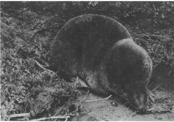
FIG. 3. Photograph of a feeding Blarina brevicauda .

species of B. brevicauda appeared later in the early Pleistocene, perhaps during the Kansan glacial, but before the origin of the two other species of Blarina ( B. carolinensis in the mid-Irvingtonian and B. hylophaga after the Wisconsinan glaciation). Continuity of gene flow between the two semispecies of B. brevicauda during the Pleistocene and Holocene and the absence of fixed chromosomal differences between the semispecies apparently prevented speciation of these phenotypes (Jones et al., 1984).