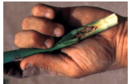
Figure 2. Common stalk borer larva tunneling in corn.