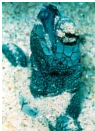
A loggerhead hatchling emerges from its nest.