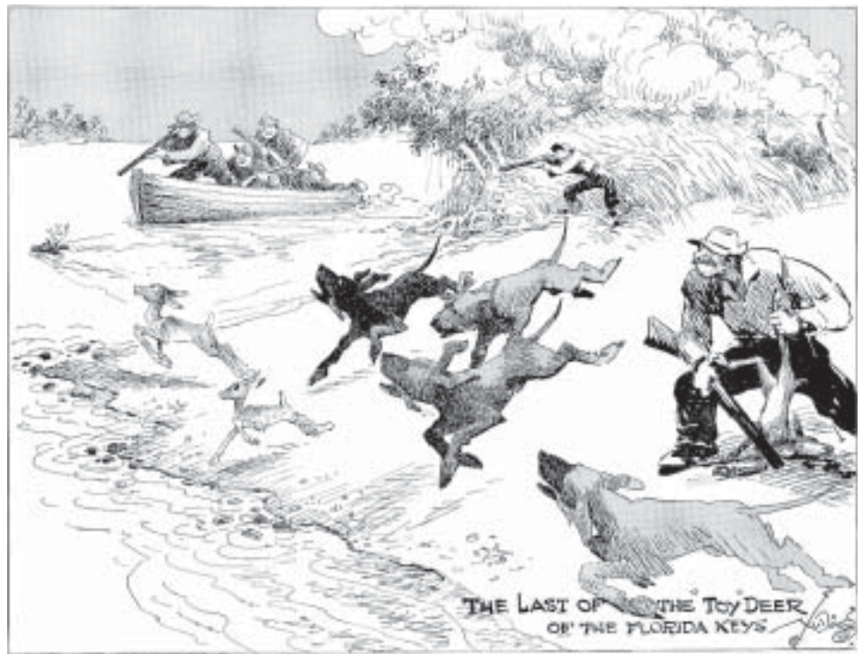
THE SMALLEST SPECIES OF DEER IN NORTH AMERICA. ALONE, UNGUARDED AND ON THE WAY OUT!

A previous translocation in 1999 that involved moving three Key deer from Big Pine Key to Little Pine Key was unsuccessful; two of the three translocated deer swam back to Big Pine Key. Because of this homing behavior, Key deer will be translocated to Sugarloaf and Cudjoe Keys using “soft release” techniques, where deer are maintained in enclosures for several months to assist in developing site fidelity. We anticipate moving approximately eight deer (equal numbers of males and females) per year to each island in each of three consecutive years. All translocated deer will be fitted with radio transmitters that will allow biologists to monitor them. Success will be measured by the survival and reproduction of the translocated deer.