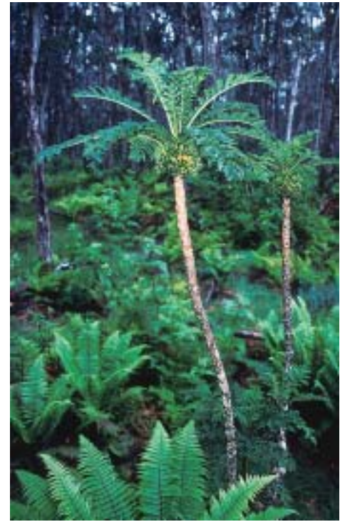
Cyanea shipmanii is one of the endangered plants being propagated at Hakalau Forest NWR.