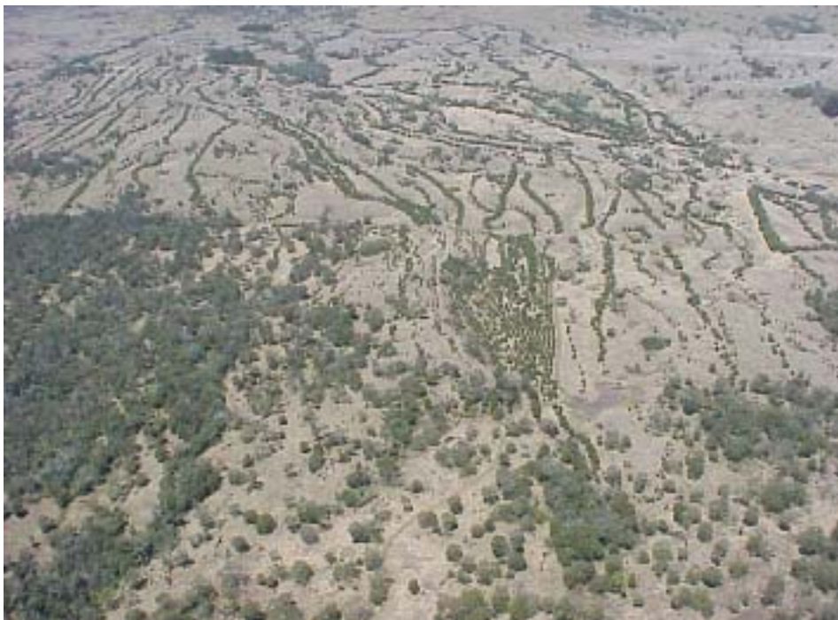
Reforestation of cleared lands at Hakalau Forest NWR.