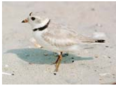
Adult piping plover

This new, intensified monitoring approach has benefitted Chincoteague's piping plover program in several ways. The most prominent improvement has