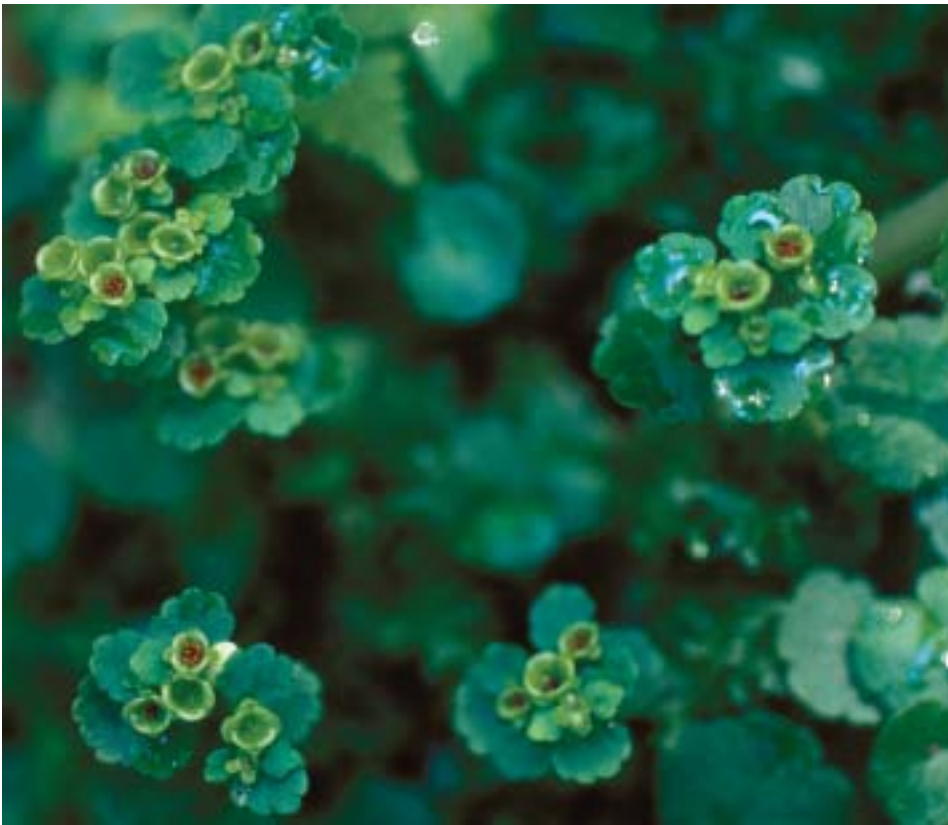
Golden saxifrage

Minnesota where the threatened Leedy's roseroot ( Sedum integrifolium spp. leedyi ) occurs. Listed in 1992, this plant occurs on only four sites in southeast Minnesota and three in New York. Refuge expansion would provide more protection for the Northern monkshood and other glacial relict snails as well. In a cooperative effort with the refuge, Iowa