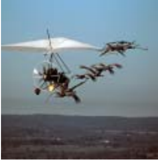
Operation Migration cranes follow ultra lite craft.