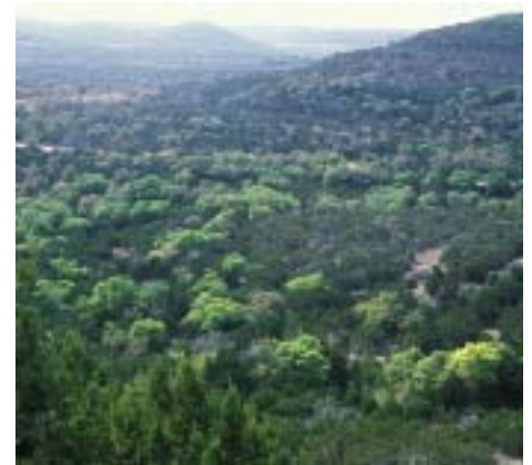
Above top: A refuge biologist installs an artificial nesting cavity at Piedmont NWR for the endangered red-cockaded woodpecker.