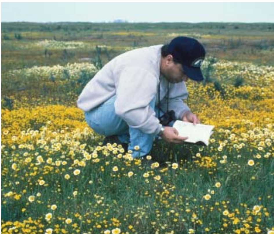
Left: A profusion of wildflowers blankets Merced NWR in California's Central Valley. The refuge also provides habitat for a variety of rare animals, including fairy shrimp and the San Joaquin kit fox.