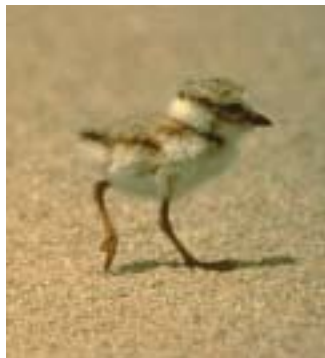
A piping plover chick walks the beach at Chincoteague NWR.