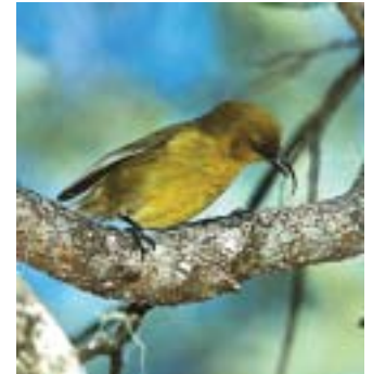
The 'akiapala'au, an endangered Hawaiian forest bird.

Wass gives volunteers most of the credit for replanting efforts within the refuge. Led by refuge staff, volunteer groups from schools, Scouts, conserva-