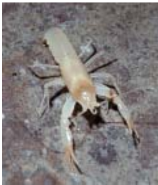
Top: Ozark big-eared bat