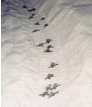
Loggerhead hatchlings head for the ocean.

F ive blurry faces peer expectantly over the edge of a black tarp at a seemingly insignificant indentation in the sand. The silvery moonlight illuminates their anxious faces and the rippling, multifaceted surface of the nearby sea. Suddenly, the grains of sand shift, ever so slightly, and a tiny dark green flipper pokes out. Secretive smiles are shared all around the group and a quiet elation is felt by all present. Moments later, a little head emerges and tiny black eyes blink at the light while the sea turtle hatchling lays motionless, with only half of its small body visible. The little loggerhead is exhausted, but it still has a much greater journey ahead of it tonight. For now, the only thought on anyone's mind is one of simple joy: after months of waiting, the babies are finally here.