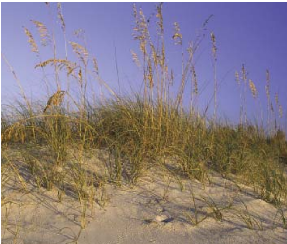
Alabama beach mouse habitat at Bon Secour NWR.