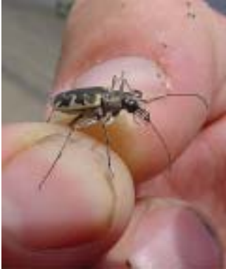
Puritan tiger beetle

P uritan tiger beetles ( Cicindela puritana ) are found in only two places in the world: the Connecticut River in New England and a small part of the Chesapeake Bay in Maryland. This unusual species has already disappeared from most of its historical range in New England, and Maryland populations are threatened by habitat loss and degradation (U.S. Fish and Wildlife Service 1993). Due to declining populations and continuing threats, the Puritan tiger beetle was listed in 1990 as a threatened species.