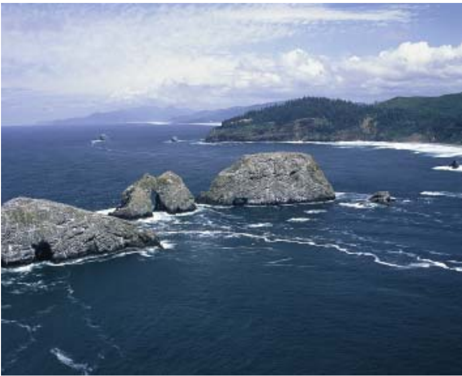
Top: Also established by President Theodore Roosevelt, Three Arch Rocks on the Oregon coast is the oldest refuge west of the Mississippi. It provides an undisturbed sanctuary for tufted puffins, other seabirds, and several species of marine mammals, including the endangered Steller's sea lion.