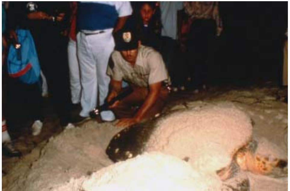
Observing a nesting loggerhead.