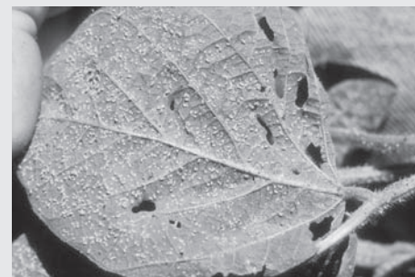
Soybean aphids like these can reduce yields by 20 percent. UNL entomologists continue to work on efforts to control the pest.

The team of entomologists is now examining those thresholds in specific arenas, such as irrigated and early or late-planted fields. In addition, they also are looking at yield loss mechanisms, including photosynthesis changes, along with plant growth and other factors.