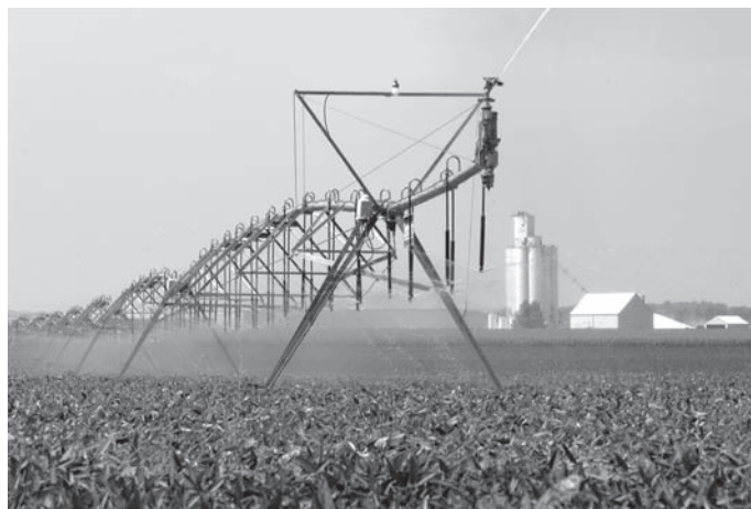
UNL's Water Optimizer is undergoing further refinement to make it a more effective, versatile tool for farmers looking to more effectively use irrigation water.