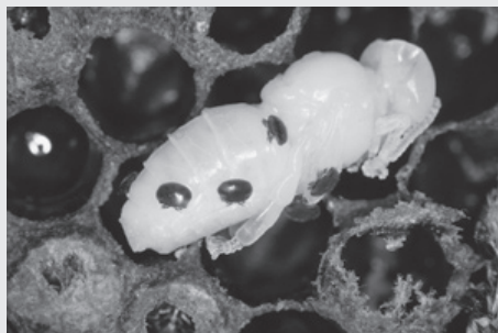
Varroa mites are a significant pest of honeybees. UNL entomologists are working on strategies to reduce their populations in bee colonies.

The varroa mite is a major pest of honeybees worldwide, but its control often is difficult because the two organisms are so closely related.