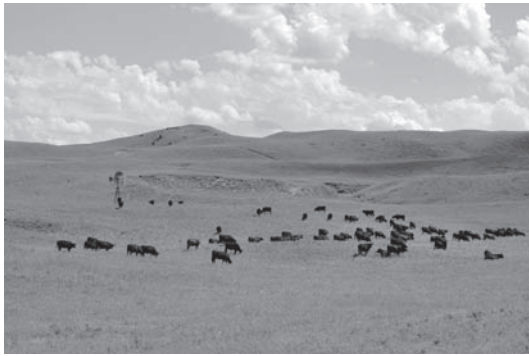
Nebraska's Sandhills, now a region of gently rolling sand dunes blanketed with prairie grasses and wetlands that provide ideal habitat for wildlife and livestock, once were little more than a swirling desert.

The research is part of UNL's Sand Hills Biocomplexity Project.