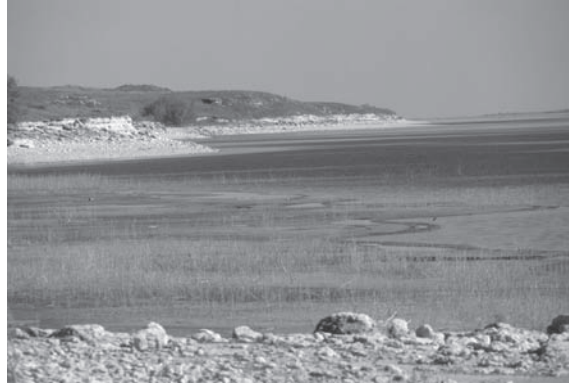
Several years of drought have left Lake McConaughy at record low levels. UNL research has found that leaving more water in the reservoir for recreational purposes might pay off overall for the state.

Such a "reservoir augmentation program" could take a variety of forms, including periodic purchase of water by recreation-related interests, the purchase of storage rights or the purchase of a long-term insurance policy in which McConaughy water owners would agree to a modified set of release rules in return for a periodic premium payment.