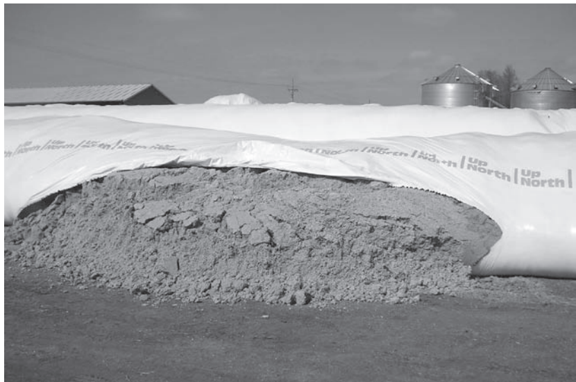
Compressing wet distillers grains alone into silage bags results in splitting, as shown here, but UNL researchers have found that mixing them with drier, bulkier feeds improves storability.

At 65 percent moisture content, wet distillers grains alone cannot be stored in silage bags or bunkers like corn silage