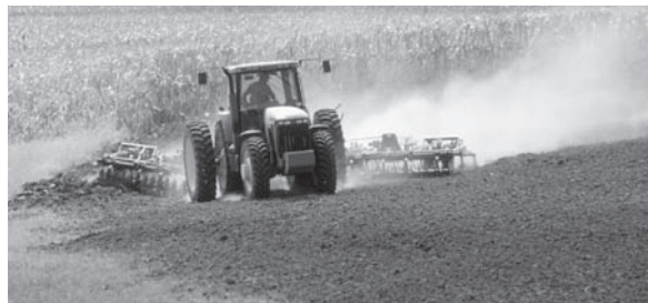
IANR scientists have found that one-time tillage on no-till farmland might be justified to correct a problem in the field but otherwise should be avoided.

While the scientists found the one-time tillage did not reduce soil organic matter, soil physical properties and yield, it did not have a positive effect on soil properties or yield. One time-tillage also reduced the risk of phosphorus runoff.