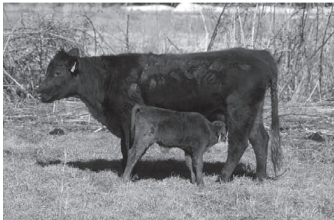
Calves whose mothers receive supplemental nutrition late in pregnancy may be born heavier and, ultimately, have improved pregnancy rates.

cows that received a protein supplement late in pregnancy achieved first-service pregnancy, compared with just 45 percent of those from cows receiving no supplement.