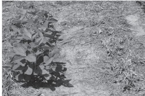
Two rows of soybean plants are shown eight days after they were sprayed with dicamba. The plants on the left, which contain the dicamba-resistant gene, are thriving. The plants on the right died.

The team's genetic modification technique has worked in both lab and