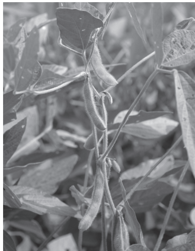
In most years, young soybean plants don't need to be irrigated until early pod formation in July.

Those results are particularly impressive given the drought conditions that prevailed on East Campus plots in June and July.