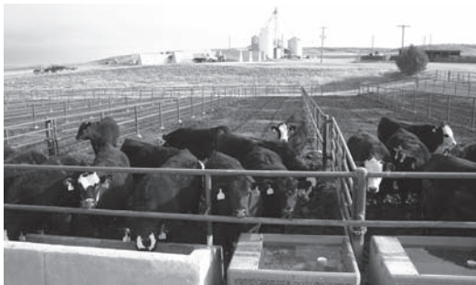
The expansion of the UNL research feedlot north of Scottsbluff is the result of a partnership between the University and cattle feeders.

The project added 61 new pens to the existing 44 pens. In addition, improvements were made to the cattle handling facilities, including a state-of-the-art