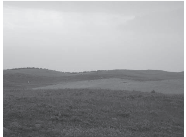
A UNL team is studying how long- and short-term climate changes might affect the stability of the Nebraska Sandhills.

The results indicated the Sandhills may be more stable than previously believed. Vegetation was allowed to return to one set of plots initially treated with herbicide after one year. These plots showed a