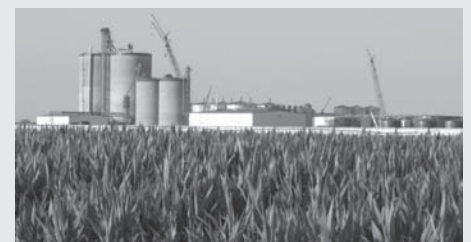
A new tool from UNL agricultural scientists will enable ethanol plants, like this one at Fairmont, to measure their greenhouse gas mitigation and energy efficiency.

The free software is available at www.bess.unl.edu .