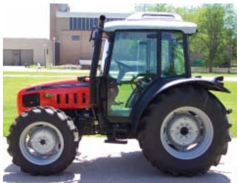
AGCO GT 75A Diesel

Institute of Agriculture and Natural Resources University of Nebraska-Lincoln