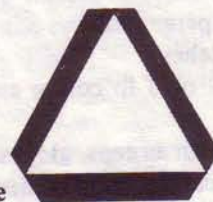
Slow Moving Vehicle

This is the traditional symbol at railroad grade crossings. Alone, or with a bell, lights or gates, it is there to warn you to be alert.