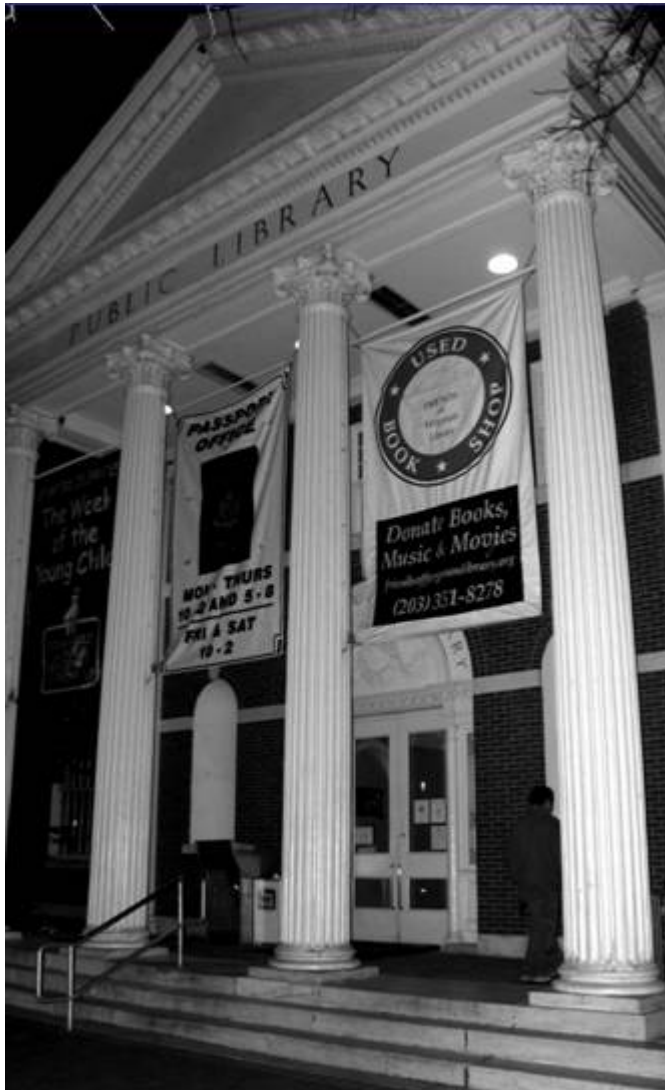
The Ferguson Library

Stamford, Connecticut today is an urban area covering over thirty-seven square miles. [59]