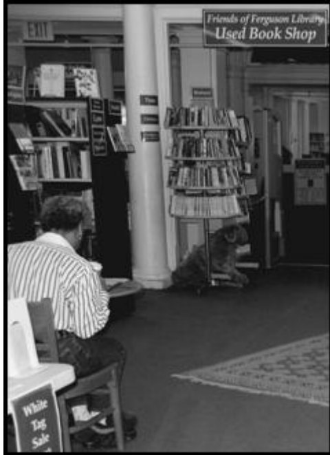
Another 9/11 survivor studies how to start a business.