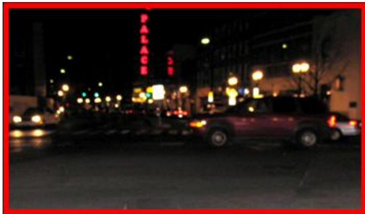
Along Bedford St., the Library’s more modern façade is in strong contrast to the Georgian-style front façade of the structure, facing Broad St. The scale of both, however, is equally grand.

Volunteer leaders such as Robbie and Barb have access to Stamford in 2006 at night. [46]