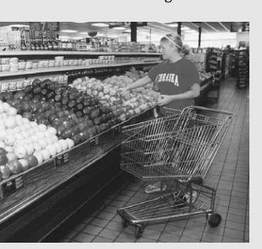
Consolidation usually affects food prices.

that concentration in the food processing industry has resulted in higher consumer prices in most sectors. The Nebraska economist and University of Connecticut colleagues