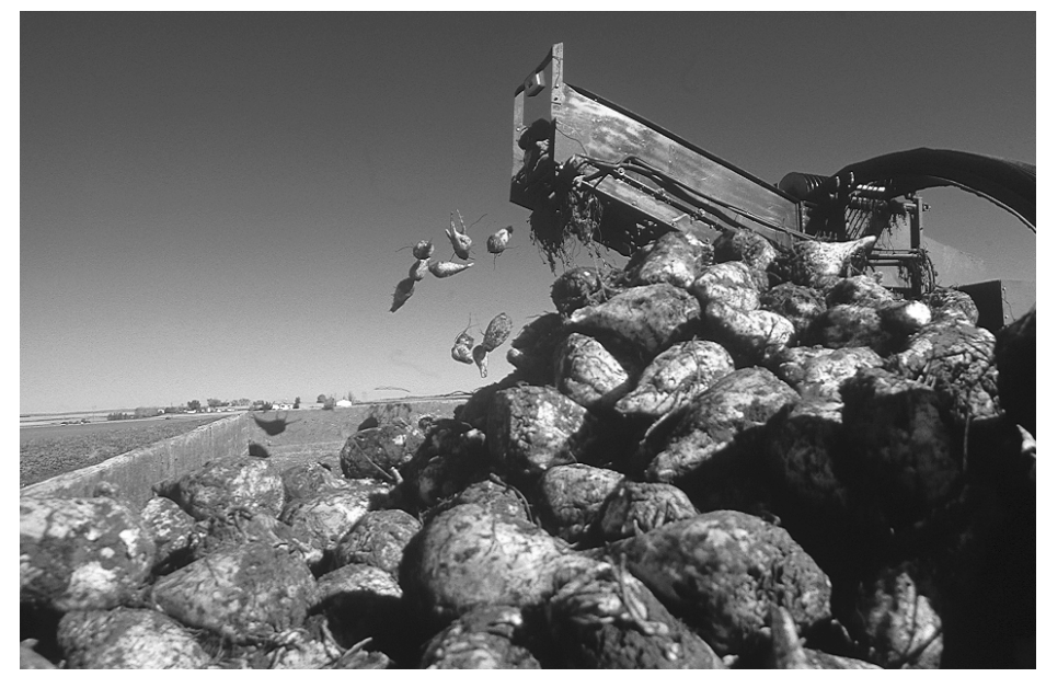
IANR research provided the scientific foundation for the flat iron steak, which is among the promising new beef products. It comes from the top shoulder of the chuck, which traditionally is used for roasts or ground beef.

These new products offer economical new beef cuts for cost-conscious consumers and boost beef carcass value. The flat iron steak, for example, costs less than traditional steaks. However, it brings more than twice as much as roasts and ground beef made from the top blade muscle. The value of the beef chuck and round relative to the rest of the carcass has increased since this research was completed.