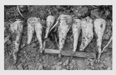
Chicory roots are now processed at the nation's first chicory processing plant.

Thanks partly to this Nebraska textile scientist's work, standards for sun-protective clothing were finalized in 2000. Standardized testing and labeling should help consumers make better-informed decisions and assure that protective clothing delivers the UV protection it promises.