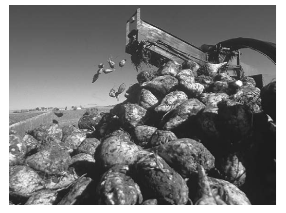
Sugarbeets are a major crop in the Nebraska Panhandle. Research answered questions about how to improve production.

proper beet variety is key to producing high quality beets and dealing with production problems such as weather, disease, insects or irrigation.