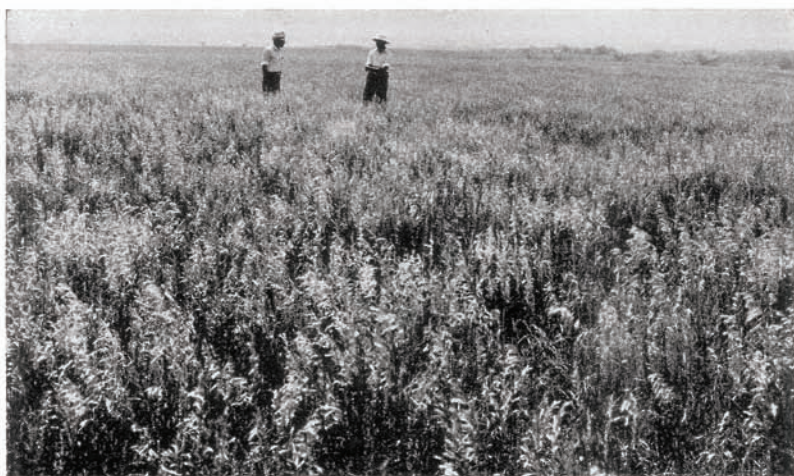
FIG. 17.—Brome grass is a good substitute for the prairie. It is Nebraska's best pasture grass. Production of brome grass seed can be made a profitable enterprise.

Brome grass is also fairly well adapted to most of central Nebraska. Many farmers in this area have found brome grass-alfalfa meadows to be their most profitable land from the standpoint of both pasture and seed production. Brome without a legume is likely to become "sod bound" and unproductive. The low productivity of pure brome stands is due to a shortage of available nitrogen. Legumes supply this need. Alfalfa