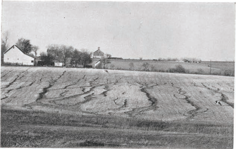
FIG. 3.—The effects of a heavy rain immediately after seedbed preparation.

The destruction of vegetation or the preventing or retarding of its growth by heat and drouth may in some instances be an important factor in soil erosion. This is particularly true when prolonged drouth periods are followed by strong winds or by normal or excessive rainfall.