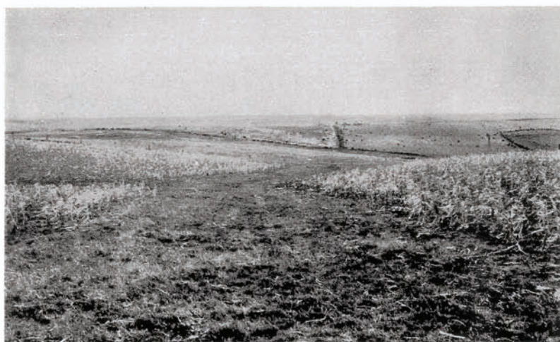
FIG. 15.—Permanently grassed draws prevent gullying and at the same time produce hay and grass seed.

For the eastern half of Nebraska, a brome grass and alfalfa mixture not only forms a tough non-erosive sod, but at the same time can be made to produce a profitable crop of seed or hay. This is particularly true where the water channel is broad and flat and where it is necessary to provide a wide protected channel.