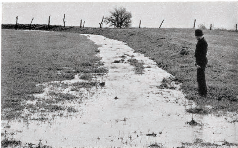
FIG. 11.—A terrace outlet discharging water on a pasture. This is a profitable way to use surplus water.

Terraces cut long slopes into numerous short ones, thus reducing soil losses greatly. Slopes that do not exceed 10 per cent and are long and smooth are best adapted to terracing. Irregular slopes, which require terraces far from parallel, are difficult to handle as cultivated fields. Medium-sized gullies that require sharp turns in ordinary contour opera-