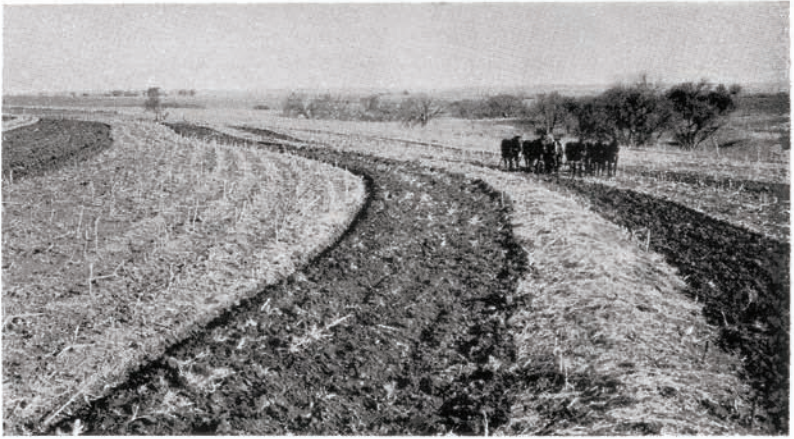
Fig. 10—Contour plowing with a six horse team on a gang plow in a terraced field.

slope as nearly on the contour and as close together as possible. The uneven strips lying between these fields are then planted to permanent grass which may be profitably used for hay and seed production, and pastured during the early spring and late fall months. The advantage of this type of strip cropping is that it provides regular-shaped cultivated fields, field borders are permanently marked, and point rows are eliminated. A mixture of brome grass and alfalfa is a good one to use for permanent strips in eastern and parts of central Nebraska. Blue grama grass or other native grasses are suggested for central and western Nebraska.