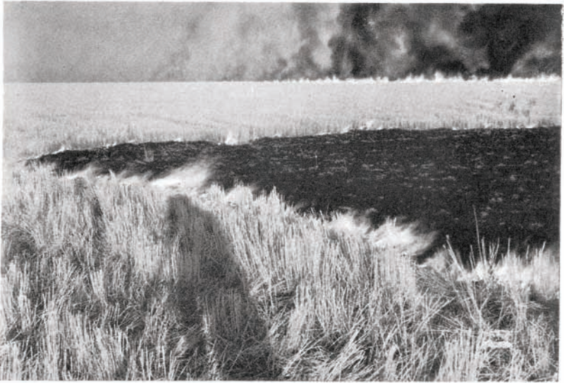
FIG. 18.—Burning depletes soil organic matter and reduces fertility and water absorption.

the fertility and stability of soil is that of returning nearly all plant materials to the surface where they may decay and return their substance to the soil.