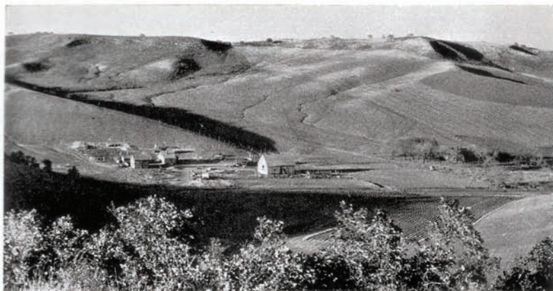
FIG. 5.—Much steep land has been broken that is not fit for tillage. Such land should be returned to grass.

the flooding of land which would otherwise be free of this menace. Little attention has been paid to this problem by road overseers. Corrective measures such as drop inlets are now being used to a limited extent, but a more general study of this problem is needed.