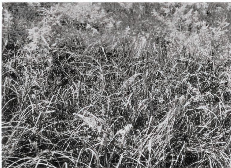
FIG. 1.—The native prairie contained both grasses and legumes. The dense growth retarded runoff.

This abundance of water, of springs, and of marshy flat lands was the natural result of the prairie cover. The tall grass with its underlying debris provided a condition of utmost effectiveness for rapid absorption of rainfall and for holding winter snows. Under these conditions, runoff could occur only from extremely heavy rains of more than usual duration. As a consequence, the deep subsoils of eastern Nebraska were filled to capacity with water throughout their entire depth. Excess water in the upper profile drained toward the draws and the valley land, thus creating springs and providing a constant and even source of water for streams.