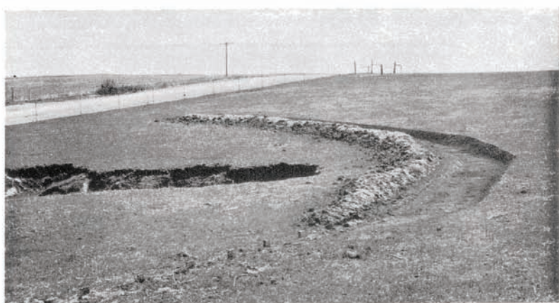
FIG. 16.—Diversion dikes, at the head of overfalls, carry water away and spread it on grass where it will do no damage. The gully can then be healed with grass, trees, and shrubs.

It is often possible to quickly check an overfall in a pasture by means of a diversion dike. This resembles a terrace in cross-section although the ridge is usually built up considerably higher than that of a terrace. The dike is thrown up a short distance above the overfall. The channel above the dike is given a slight grade not to exceed 0.8 per cent and leads to