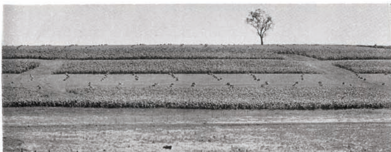
FIG. 9.—Strip cropping reduces runoff and soil losses. Note the grassed draws where excess water can escape without damage to the project.

When weed growth starts in the spring, the ridges may be split, again using the basin attachment. In combatting weeds, basin-listed fallow land may be handled in much the same manner as that listed to row crops, although any practice which leaves the dams intact is preferred. A spiketooth harrow can be used successfully to kill weeds before they get well started. If the ordinary listed-corn cultivator or go-devil is used, a small shovel mounted in front of each bell wheel to cut through the dam will permit the machine to operate more smoothly.