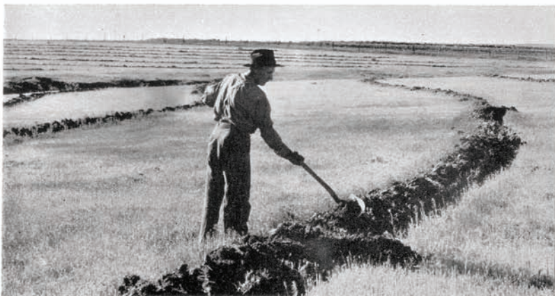
FIG. 13.—Pasture furrows help to reduce runoff and thus stabilize pasture gullies. The conserved moisture increases the growth of grass.

Pasture contour furrowing consists of a series of plow furrows constructed on the contour at a horizontal spacing as close as 10 feet on a very steep slope and as far apart as 25 feet on a very gentle slope.