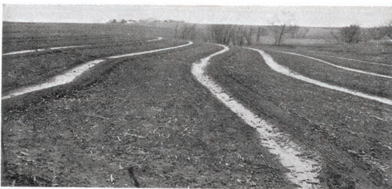
FIG. 12.—Pasture terraces built before the grass is seeded provide permanent erosion control and permit practically no runoff.

Pasture terraces provide an excellent means of preventing excessive runoff, not only while the grass is attempting to reestablish itself, but also later when the closely grazed grasses are unable to hold back dashing rains.