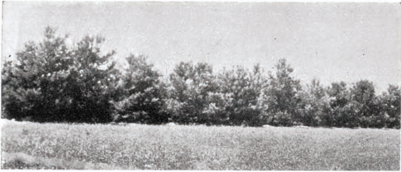
FIG. 4.—Trees may be used effectively and profitably for the control of wind erosion, especially on the lighter soils.

type, structure, and condition may often have greater influence than slope in determining the degree of erosion.