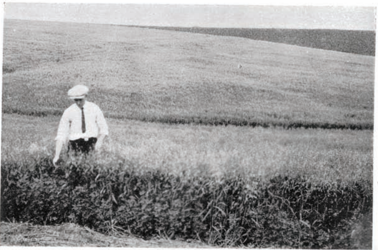
FIG. 6.—Sweet clover in oats in eastern Nebraska. Frequent use of legumes in the rotation is an accepted practice in the eastern one-third of the state.

Crop rotations which include legumes and grasses tend to add organic matter or humus to the soil and increase crop yields. Experiments have shown that when a good rotation is used there is less runoff and less erosion. This is because the organic matter in the soil makes it more absorbent of water, and the soil particles are held together in such a way that they resist erosion. In one six-year experiment, land of glacial origin rotated with corn, wheat, and a clover-grass mixture lost 233 fewer tons of soil per acre and had 55 per cent less runoff than plots in continuous corn. Corn on rotated land lost 29 per cent less water by runoff and 41 fewer tons of soil per acre than did land in continuous corn.