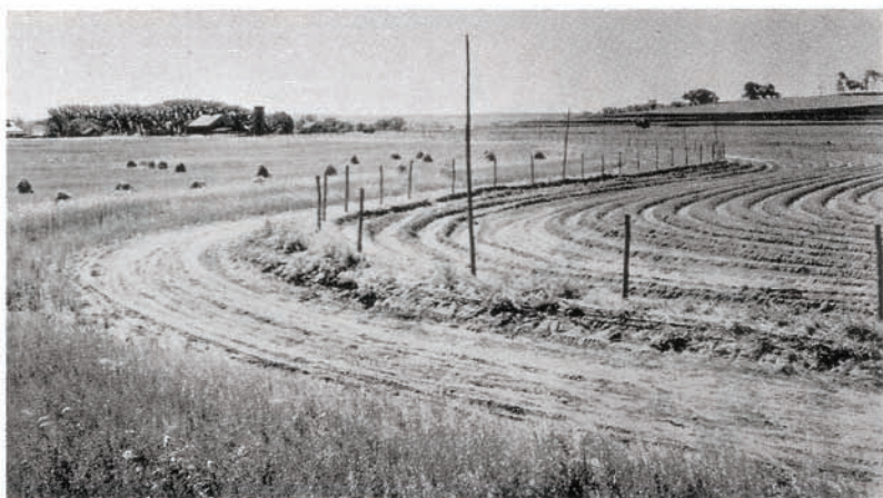
FIG. 7.—Field rearrangement for contour operations helps to eliminate point rows.

The practical use of the contour method of farming requires that in parts of most fields, the operation of farm machinery will need to be slightly away from the contour. In many fields, this will involve crossing small depressions or draws in a direction that is not on the true contour. Runoff water may concentrate in these low places and thus cause erosion. Such water courses need to be protected by planting them to grass or allowing other vegetation to grow which will hold the soil but permit the water to flow without damage. Many fields have been severely damaged