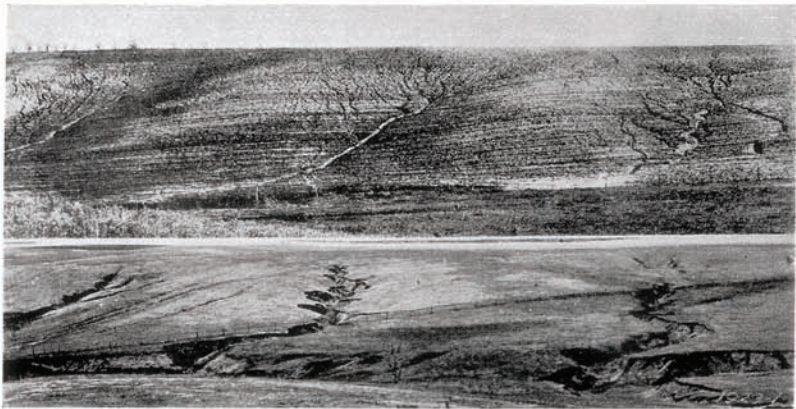
FIG. 14.—Field draws, if unprotected, can readily become impassable gullies.

The lowering by erosion of natural field draws or depressions has caused permanent damage to many fields through the steepening of the side slopes which lead into them and the loss of the top soil. This process has been hastened by the practice of plowing or working in the depressions each season, only to have this loosened soil wash away soon after. Fields damaged by the lowering of these depressions become more difficult to cultivate each year. Finally large fields are divided into many smaller ones because of the depth of the depressions. Contour tillage of fields damaged in this manner becomes impractical.