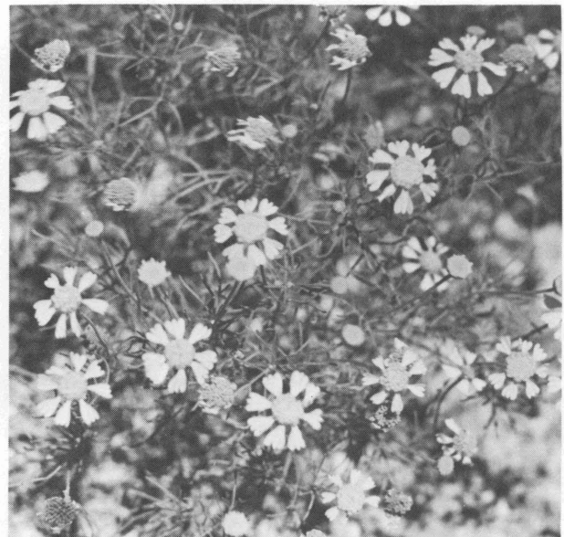
Figure 2. Mature plant of bitterweed in early summer showing finely divided leaves and flower heads with toothed rays.