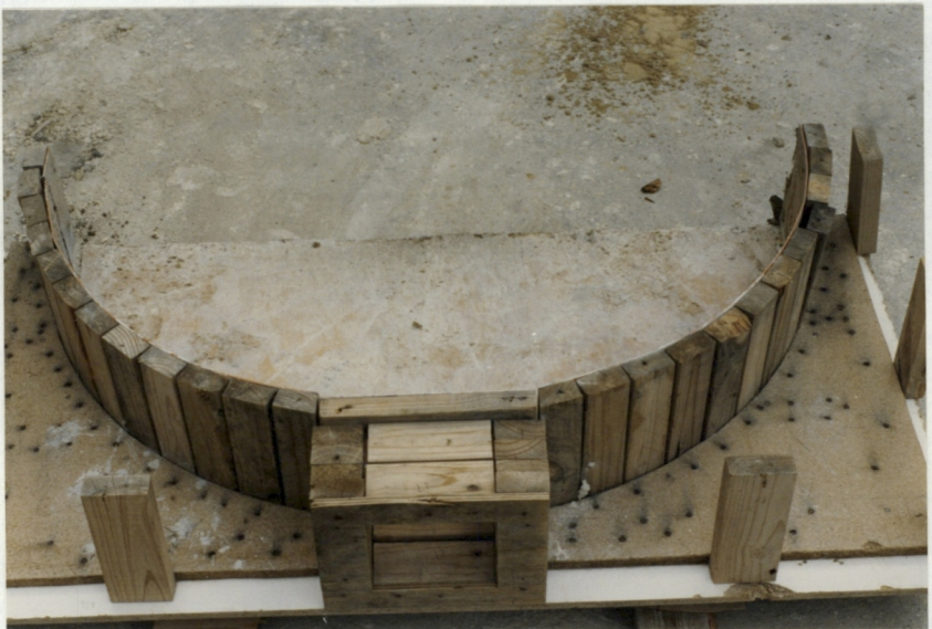
B arch mould