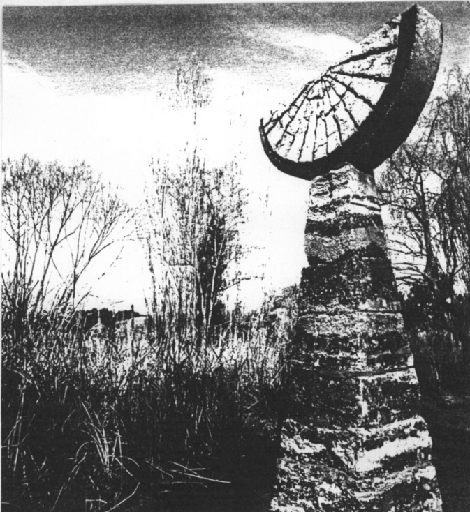
Solace 2.4 m

Construction: The base section was cut into blocks after casting to improve portability. The faces of the top section were tiled slabs. Colour variation is due to addition of manganese dioxide (darker areas) and temperature difference in kiln. Blocks were mortared together on installation, set onto a concrete slab and supported internally with steel pipe.