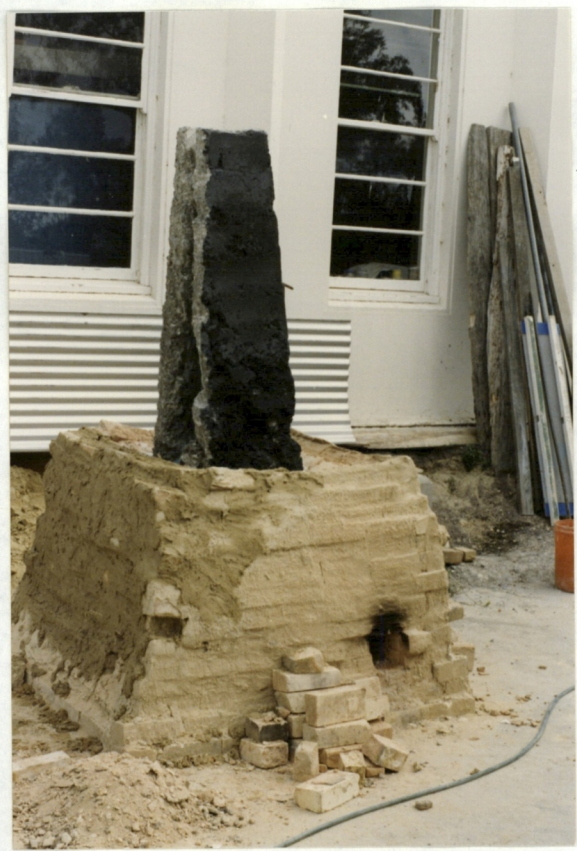
D kiln section