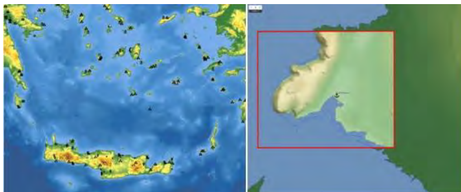
Figure 1 - The map of the project. Phalassarna's coastline now and then (zoom in) is presented in the second picture.