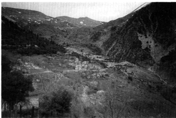
Figure 1 - A panoramic view of the Petroxori village

In general, Pindos zone formations are characterized by an extremely complicated structure. They appear highly folded in a series of anticlines and synclines, interrupted and displaced by fracturing and faulting. Particularly, at the center of the village, the flysch formation occupies the core of a syncline structure with an axis of N.NW-S.SE direction and a plunge towards N.NW. Both, the eastern and western limbs of this syncline are occupied by the transition to the flysch