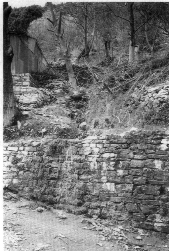
Figure 4 - Uncontrolled flow of the surface water through the village

Figure 1 proves that those phenomena were well understood by the old residents of the village, because, despite their initial attempts (Fig. 6), they finally stopped constructing buildings along the zone occupied by the debris materials. In that picture is clearly presented that the majority of the houses were constructed on the north-eastern and the south-western parts of the village; occupied by the flysch formations and the limestones, respectively. On the contrary, the central section of the village was finally used for cultivation. However, the latest owners of the properties ignored the experience of the past and reconstructed houses on the unstable areas (Fig. 5).