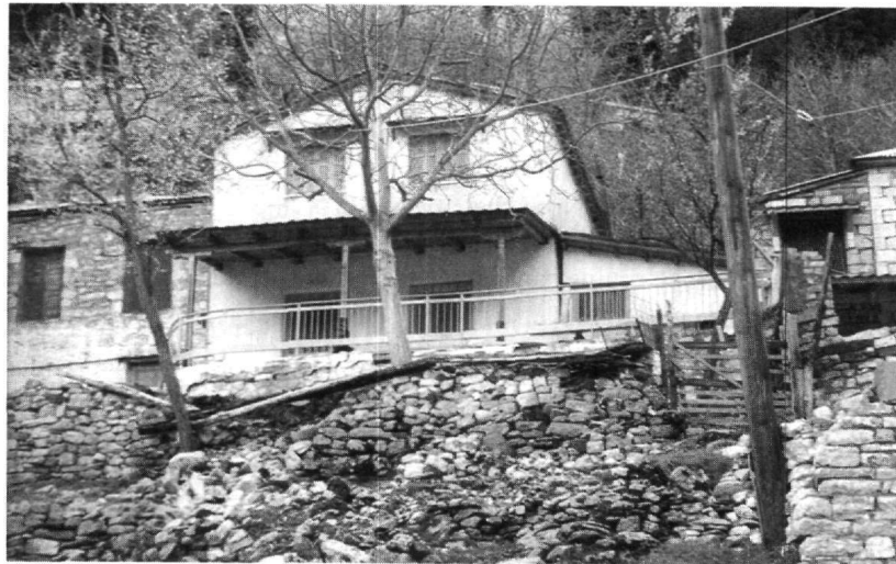
Figure 5 - A typical example of slope that failed during a year with prolonged high precipitation because of the increased loading of its crest. The landslide caused extended damages to the house