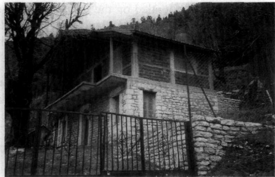
Figure 3 – Reconstruction and extension of an old house

According to the same reporting method (WP/WLI 1994), the triggering causal factors of those landslides are, regarding the physical processes, the prolonged high precipitation and, regarding the man made processes, the loading of slopes or their crests and the uncontrolled flow of the surface water through the village (natural irrigation and water leakage from services). The loading of the slope was succeeded by the construction and lately the reconstruction and the extension of buildings (Fig. 3) and the uncontrolled flow of the surface water through the village (Fig. 4) was caused by lack of drainage network.