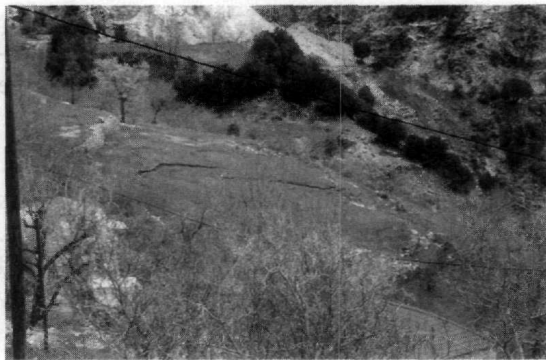
Figure 2 - Rotational slides affecting the terraces