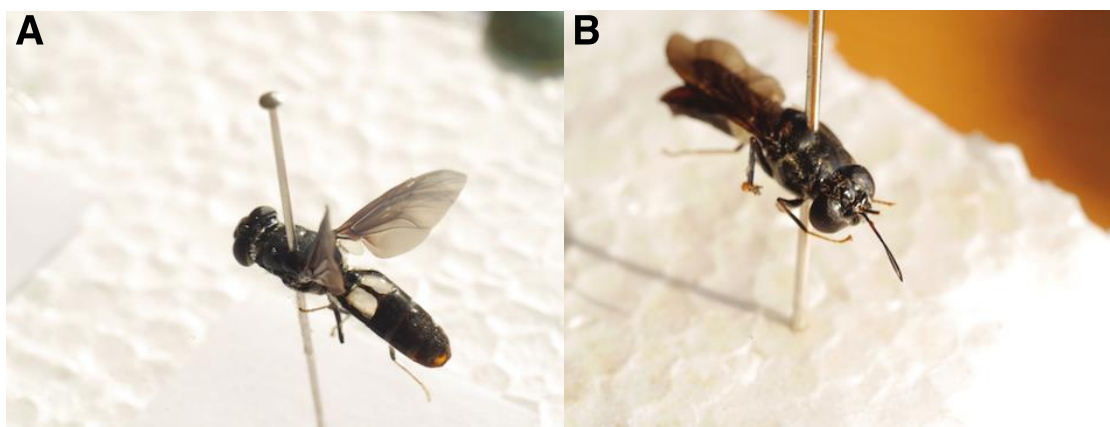
FIG. 1. (A) Female adult of H. illucens (missing antennae) caught at Kampos of Agiassou, Naxos and (B) female adult of H. illucens (left antenna damaged) caught at Alimos, Athens.

such as rotting fruits and vegetables, animal manure and human excreta, achieving a dry mass reduction of ca. 55% (Sheppard 1983, Newton et al. 2005, Myers et al. 2008, Diener et al. 2011). Larvae can reach 27 mm in length and are whitish in color with a small, projecting head containing chewing mouthparts.