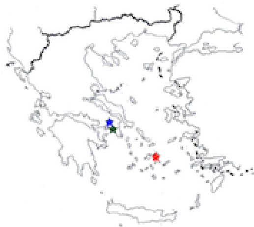
FIG. 2. Locations of where H. illucens was recorded (red asterisk: Kampos; blue asterisk: Aigaleo; green asterisk: Alimos).

recycling. More specifically, H. illucens larvae have the potential of improving organic waste into a rich fertilizer (Diclaro II and Kaufman 2015). Furthermore, presence of H. illucens larvae repels oviposition