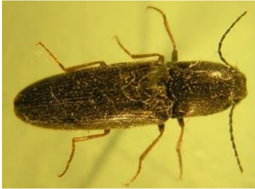
FIG. 4. Adult of Agriotes gallicus .