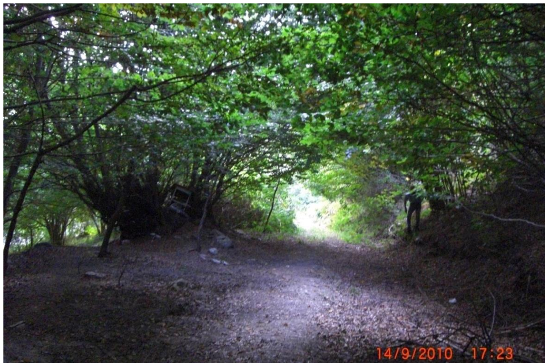
FIG. 2. Forest of hazel trees in Tsairoudia area.