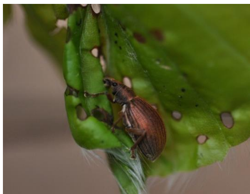
FIG. 3. Adult of Phyllobius pyri .

On hazel trees, Agriotes acuminatus Stephens and Agriotes gallicus Lacordaire (Coleoptera: Elateridae) were collected (Fig. 4). The first species, A. acuminatus , was collected on May (20 and 28) and June 8 of 2011, in hazel trees. The second species A. gallicus was collected on June 8.