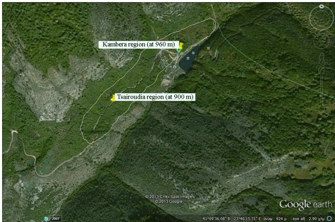
FIG. 1 .The sampling areas (Tsairoudia and Kambara) on MountMenoikio, North East Greece.