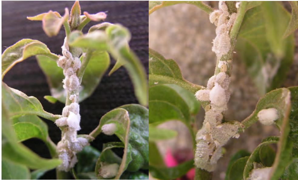
FIG. 1. Bougainvillea infested by the mealybug Phenacoccus peruvianus .

similar to other species of mealybugs, by sap sucking and by honedew secretion, which serves as a substrate for the development of sooty mold. Studies on the natural enemies of P. peruvianus in the Mediterranean revealed high levels of parasitization by a species belonging to the genus Acerophagus , which is believed to have been accidentally introduced to the area (Beltra et al. 2013). Mealybugs are considered major invasive group and currently one out of four of the mealybug species recorded in Europe are alien species (Pellizzari and Germain 2010).