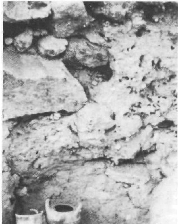
FIG. 1. Holes of nests of A. crinipes and O. latreillei in the walls of the archaeological buildings at Akrotiri, Santorini.

These three species were collected in all observation years in glass collectintubes. Of these A. crinipes and O. latreillei , which are solitary species, both build colonies with tunnels a short distance appart but not actually touching each other. The number of such colonies in the walls of the Akrotiri settlement is fairly large, and conspicuous through the holes of entrance and exit of the insects (Fig. 1). M. albifrons albovaria is a predator on A. crinipes (Tkalcu personal communication). It is known from the literature that all species of the genus Melecta prey on Anthophora species (Imms 1947, Hobbs et al. 1961).