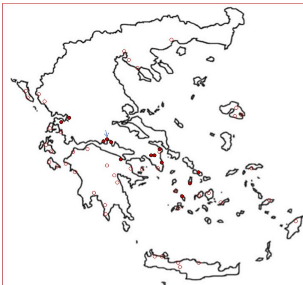
FIG. 1. Sampling sites in Greece with eucalypts. Examined sites are represented by empty circles and full circles are sites with eucalypt foliage bearing with Thaumastocoris peregrinus . A symbol may correspond to more than one site of examination. The site at Itea, Fokis where the insect was found for first time is indicated with an arrow.