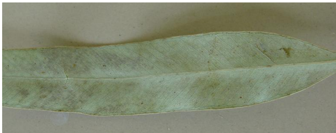
FIG. 3. The underside of the leaf blade and the associated leaf damage (chlorotic leaf areas and areas with initiation of bronzing) caused by Thaumastocoris peregrinus is shown. The leaf in a few days becomes bronze in color, hence the vernacular name of the insect ‘bronze bug’.