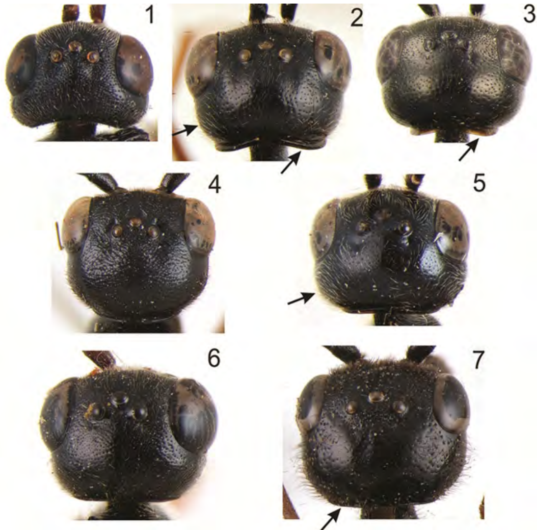
FIGS 1-7. Head, dorsal view, of the Pristaulacus -species occurring in Greece and Cyprus (female). 1, P. barbeyi ; 2, P. chlapowskii ; 3, P. compressus ; 4, P. edoardo ; 5, P. galitae ; 6, P. gloriator ; 7, P. mourguesi

(*) Pristaulacus chlapowskii Kieffer, 1900 (Fig. 2)