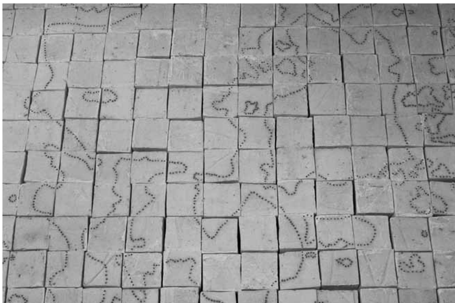
Mona Hatoum, Present Tense, detail, soap and glass beads installation, Anadiel Gallery, Jerusalem 1996 (4.5 x 241 x 299 cm), courtesy: White Cube, London, and Anadiel Gallery, Jerusalem.