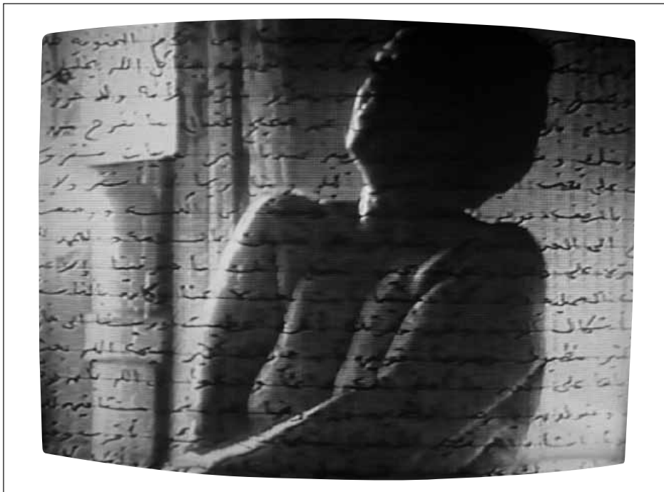
Mona Hatoum, Measures of Distance, 1988, colour video with sound (duration: 15 minutes), courtesy White Cube, London.

This is a scene that echoes the work of Jean-Luc Nancy, for whom the body is an open space that is more spacious than spatial; it is a place, a place of existence. As it is equated with the multiple eventualities of the skin, which is variously folded, refolded, unfolded, invaginated, exogastrulated, orificed, evasive, invaded, stretched, relaxed, excited, and distressed, the body makes room for existence (2008: 15). Similarly, the skin becomes for Hatoum “the place for an event of existence” (Nancy, 2008: 15). It bespeaks the corporeal eventness of performativity –an awkward materiality that eludes any programmatic figuration or calculable materialization, and opens up to a certain disposition of the self towards the other. The corporeal subject is enacted as fundamentally social in its sensual openness, vulnerability and physical interrelation to the other. Incorporating the other, the subject opens up –and gives room- to the radical contingency of engagement where the other is not reduced to the proper logic of possession. In the contrary, the other seems to have a knowledge of her own and reveal us in new, intimate and unforeseeable ways. It is suggestive, in that respect, that the endoscopic camera and medical science know and expose, in the most intimate details, the artist’s own body.