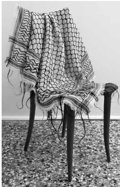
Mona Hatoum, Keffieh, 1993-1999, human hair on cotton fabric (120 x 120 cm)

violent history and political conflicts intruding in the intimate quarters of her life. For wanderers like her the borders between home and the world are blurred; their psychic agonies are interconnected to wretched social realities and world politics. These in-between, indeterminate, affective spaces of here and there, of past and present, of difference and identity, of unsettledness and reclamation, allow for modes of living across temporal and spatial distance and in close proximity with alterity. It is in these interstices that nomadic subjectivities with transformative agency emerge, producing other spaces of signifying, commemorating, and contesting. And “it is in the emergence of the interstices -the overlap and displacement of domains of difference- that the intersubjective and collective experiences of nationness , community interest, or cultural values are negotiated” (Bhabha, 1994: 2, original italics). Hatoum’s art provides representations for the nomadic subjects in their shared but