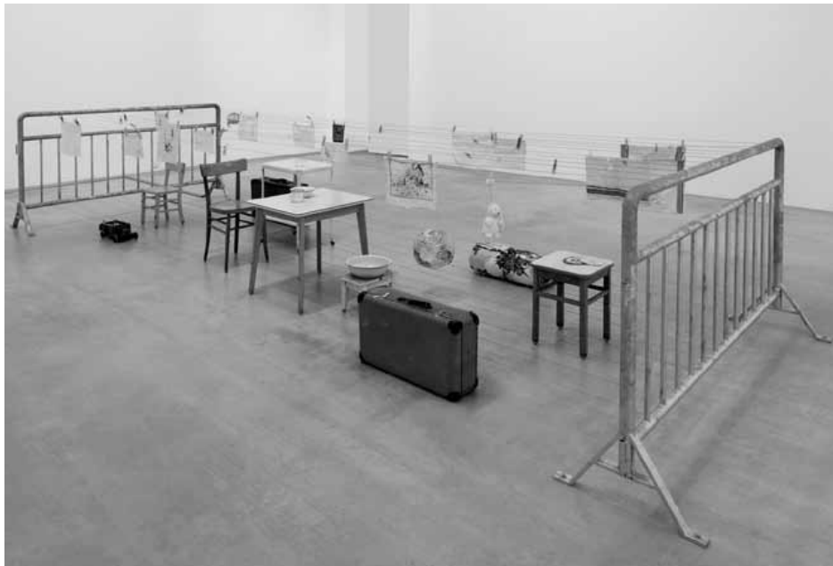
Mona Hatoum, Mobile Home II, 2006, installation with furniture, household objects, suitcases, galvanized steel barriers, electric motors and pulley system (119 x 220 x 600 cm), photo: Jens Ziehe, courtesy: White Cube, London.

As in Braidotti's exploration of a "nomadic" aesthetics, the question of style is inextricably linked with the question of the political: the nomadic artist destabilizes commonsensical meanings, translates between different cultural realities, and deconstructs hegemonic formations of