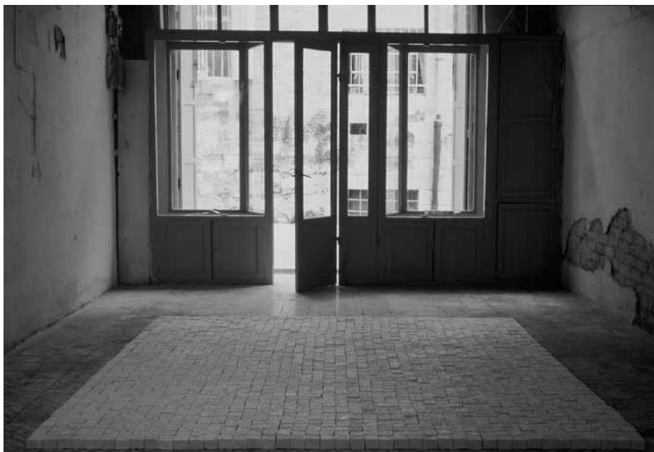
Mona Hatoum, Present Tense, soap and glass beads installation, Anadiel Gallery, Jerusalem 1996 (4.5 x 241 x 299 cm)