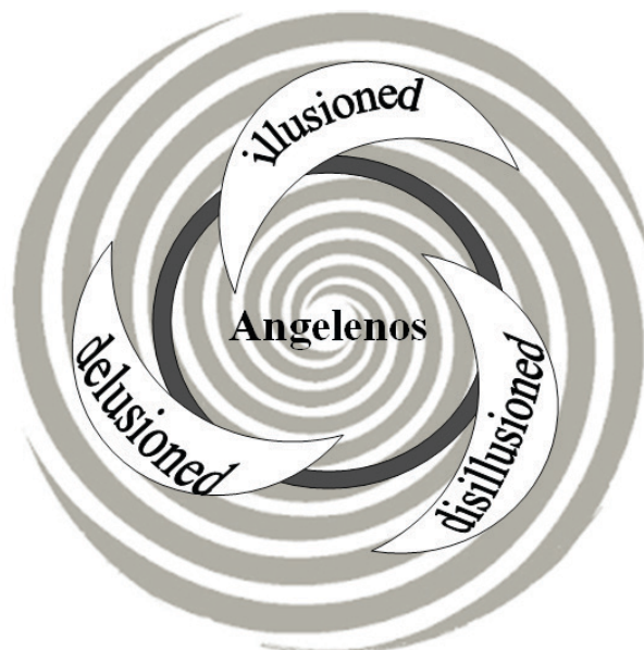
Fig. 3 The Angelenos Trialectics

Through Thirdspace, the two trialectics designed by Soja cannot be taken separately. With this ontological shift, he is importing into the spatial discourse the missing components that made modern geographical analysis fall short. He deems them too restrictive and somewhat dehumanized, but in doing so, he also complicates the nature and scope of their interactions drastically. This construction in threes, however, opens some analytical possibilities, providing an intellectual dynamic that can be applied to any space in the world. Couldn't we then continue Soja's trialectical model and think of other trialectics based on the inhabitants and their relationship to a space that is not like any other, because it is, first and foremost, theirs? The notion of belonging, of being accustomed to a particular space does give an expertise quality to those who embrace it everyday. Furthermore, the historical construction of a place and how memory is perceptible in it also inform how the lived space is conceived for those who are actually living in it. Imagining a trialectics dealing with Los Angeles and its inhabitants could be seen as the convergence of Soja's trialectics with Baudrillard's postmodern take on the megalopolis as the city of illusion and simulacra: