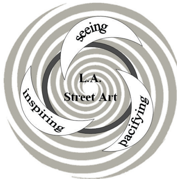
Fig. 4: The L.A. Street Art Trialectics

needs to be taken into account according to these effects. It is not the images drawn on the walls that are the most relevant, but what they represent in the space in which they are inscribed. Tim Ingold in Making: Anthropology, Archaeology, Art and Architecture , argues that when the drawing tells something more than its image, its very classification within the visual arts could be revised: “Despite its conventional classification among the visual arts, drawing is closer to music and dance than it is to, say, painting or photography.” (Ingold, 2013, p. 127) Artist John Berger goes even further as he interrogates the very act of drawing: “Could we not think of drawings as eddies on the surface of the stream of time? The drawing that tells is not an image, nor is it the expression of an image; it is the trace of a gesture.” (Berger, 2005, p. 124) This statement echoes deeper when dealing with street art. Just like Thirdspace, it introduces a movement within the urban space, it is the “trace of a gesture” that translates its momentum to the people coming into contact with them, but to what end? Could we then imagine a trialectics articulated around the role undertaken by street art in a city such as Los Angeles?