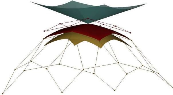
Figure 2: The original surface (below) and the interpolating linear blending surface. The permissible positions of the upmost control point is shown by a volume bounded by a cone-like surface.

Summarizing the above results one can see that the permissible positions of \mathbf{v}_{i,j} is a volume bounded by a cone-like surface the apex of which is the given point \mathbf{p}_{i,j} and its base is composed of the four boundary curves of the envelope surface (4.1) (see Fig.2).