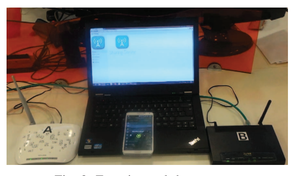
Fig. 2: Experimental demo set-up

switches to AP-B for different values of weight values w_4 . In our experiments, number of connected users to AP-B is 5 and number of connected users to AP-A is varied from 1 to 100. Note that in our analysis, we ignored the cases when the number of users connected to AP-A becomes larger than 100.