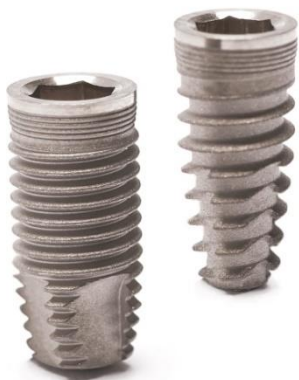
Figure 1. ProSystem® Advance implants by Permedica

in odonto-stomatological surgical interventions for single/multi-tooth reconstructions or entire dental arches, together with single crowns or prosthetic components. ProSystem® Advance implants are made of a pure grade 4 titanium (ISO 5832/2). The implant's titanium surface is micro-structured by grit-blasting it with a calcium magnesium carbonate [CaMg(CO 3 ) 2 ] based media. Calcium magnesium carbonate particles have a granulometry distribution that ranges from 200 µm to 400 µm (60-80%) and below 200 µm (20-40%). The average surface roughness (Sa) is 0.8 µm ± 0.03, thus obtaining a moderately irregular surface micro-topography (Figure 2 A and B). In order to prevent