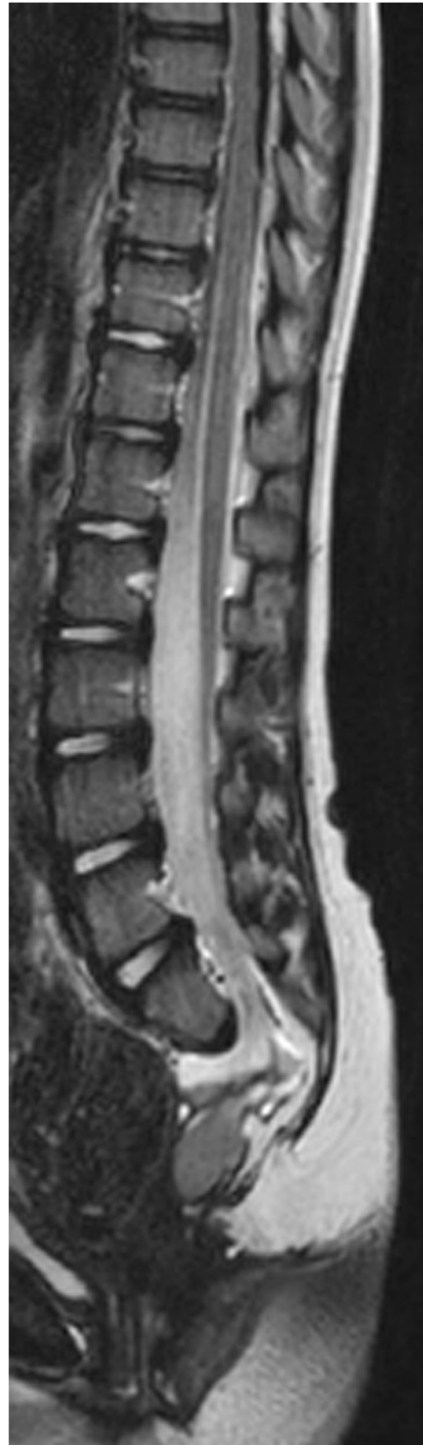
Fig. 1 Sagittal t2- weighted Lumbosacral MRI

The patient underwent a neurosurgical operation with the indication of cord untethering. After the surgical treatment, constipation improved and encopresis regressed. Clinical follow-up is still ongoing.