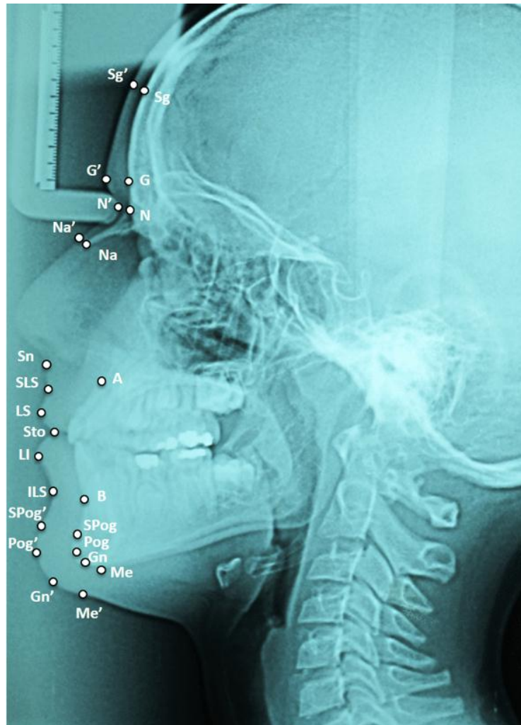
Fig. (1). Cranial landmarks according to George (20): supraglabella (Sg), glabella (G), nasion (N), nasale (Na), Point A (A), Point B (B), suprapogonion (SPog), pogonion (Pog), gnathion (Gn), menton (Me). Facial landmarks: supraglabella (Sg'), glabella (G'), nasion (N'), nasale (Na'), subnasale (Sn), superior labial sulcus (SLS), labrale superius (LS), stomion (Sto), labrale inferius (LI), inferior labial sulcus (ILS), suprapogonion (SPog'), pogonion (Pog'), gnathion (Gn'), menton (Me').