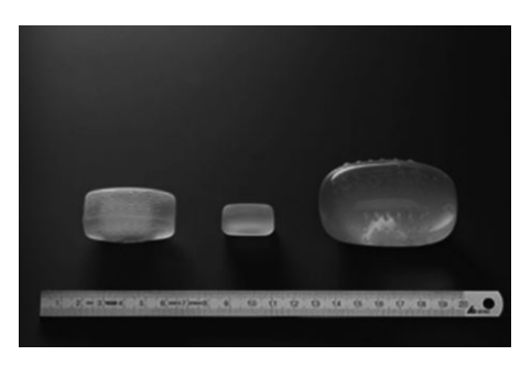
Fig. 4. Rectangle osmotic hydrogel expander: from left to right: un-swollen, without silicon shell, swollen. "Courtesy of: Osmed<sup>®</sup> GmbH (Ilmenau, Germany)".

The perforations in the "impermeable" silicon shell allow the influx of surrounding fluids. The number of perforations controls the inflow rate which in turn limits the speed of expansion (Kaner & Friedmann 2011). Compared to the first generation, a less steep swelling curve of the second-generation expanders represents a continuous expander growth with less pressure peaks (Ronert et al.