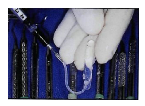
Fig. 1. Conventional expander with an external port for serial injections and manual inflation. Courtesy of: Zeiter et al. (1998).

The amount of soft tissue gain with conventional expanders has been reported to be dependent on the type of expanded tissues and the shape of the expanders (Brobmann & Huber 1985; van Rappard et al. 1988). It was observed that tissue gain was more pro-