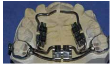
FIG. 7 The titanium TSME appliance.

mechanical stress such as on activation. No fractures occurred during the fusion.