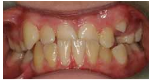
FIG. 5, 6 Extraoral and intraoral photos at the beginning of the treatment.