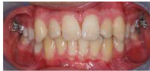
FIG. 8 Intraoral photo at the end of treatment.

The medical history revealed nickel hypersensitivity, so to avoid allergic reactions a nickel-free TSME appliance was used (Fig. 7). After taking dental impressions, the orthodontic appliance was fabricated. The patient and the parents were instructed about the activation protocol both on the transversal and sagittal dimension until the desired expansion was obtained. The appliance was then left in place for further six months. At the end of the 12-month treatment, the patient showed a dental Class I and correct transversal and sagittal relationships between the basal bone (Fig. 8).