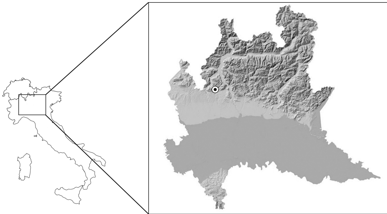
Fig. 1. Geographical location of the bird ringing station Fondazione Europea il Nibbio, Lombardy, Italy (in a highly urbanised area).