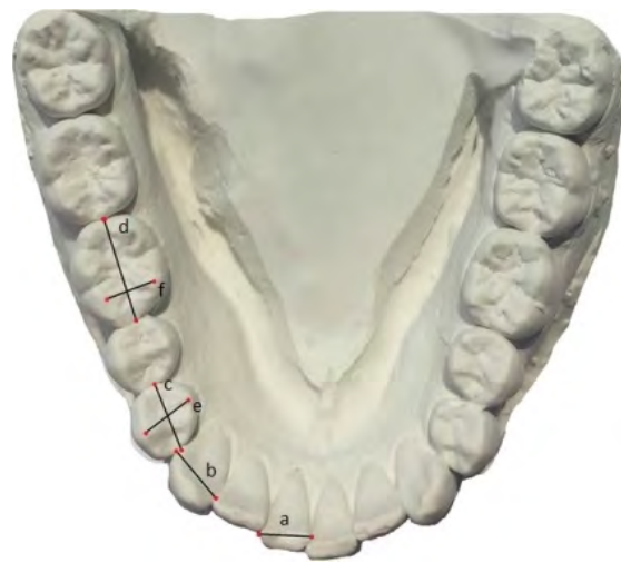
Figure 1. Dental crown distances chosen for the study in the right side mandibular arch. The corresponding distances were selected also in the left side maxillary arch: a) Mesiodistal distance of tooth 41; b) Mesiodistal distance of tooth 43; c) Mesiodistal distance of tooth 44; d) Mesiodistal distance of tooth 46; e) Distance from vestibular to lingual cusp of tooth 44; f) Distance from mesial-vestibular to mesial-lingual cusp of tooth 46.

The intra- and inter-operator biases ranged between 0 and 0.34 mm, and only 3/72 biases were equal to larger than |0.3| mm (Table 1). These biases were observed for the vestibulopalatal diameters of teeth 24 and 26 (intra-operator analysis), and the vestibulopalatal diameter of tooth 26 (inter-operator analysis). Reproducibility ranged between 72 and 99%, the worst coefficients were found for CBCT measurements (18/24 were lower than 90%),