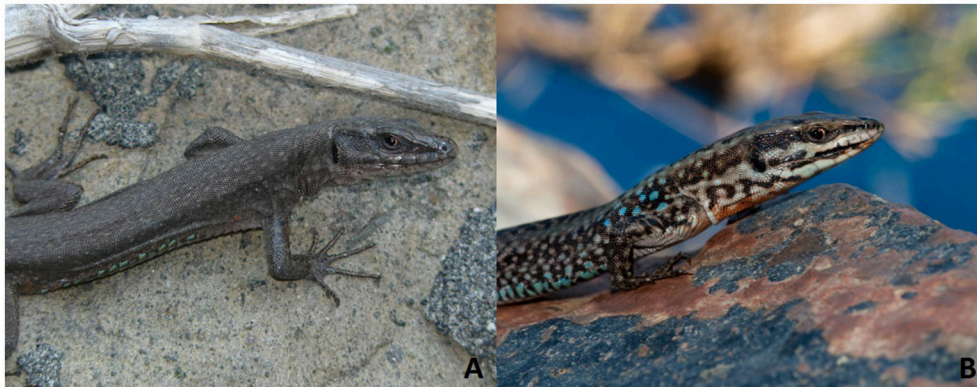
FIGURE 1 | Podarcis raffonei raffonei from Strombolicchio Island and P. r. alvearior from Vulcano Island, Aeolian Archipelago (Italy).