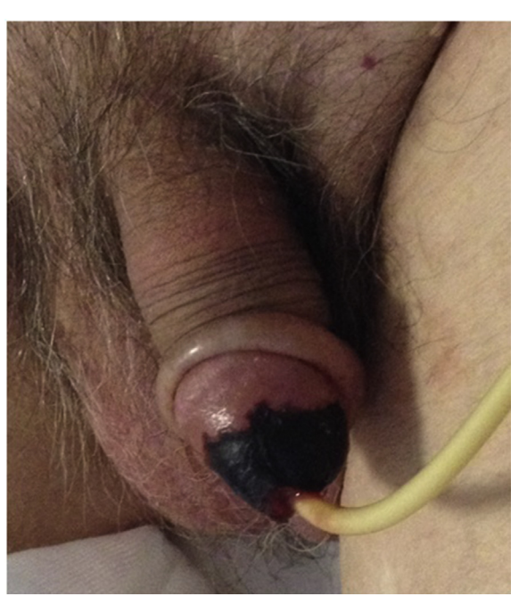
Fig. 1. Paraphimosis, the foreskin constricting the penis at the coronal sulcus. The distal glans is necrotic and the area is dry and well-demarcated.

E-mail address: franco.palmisano02@gmail.it (F. Palmisano).