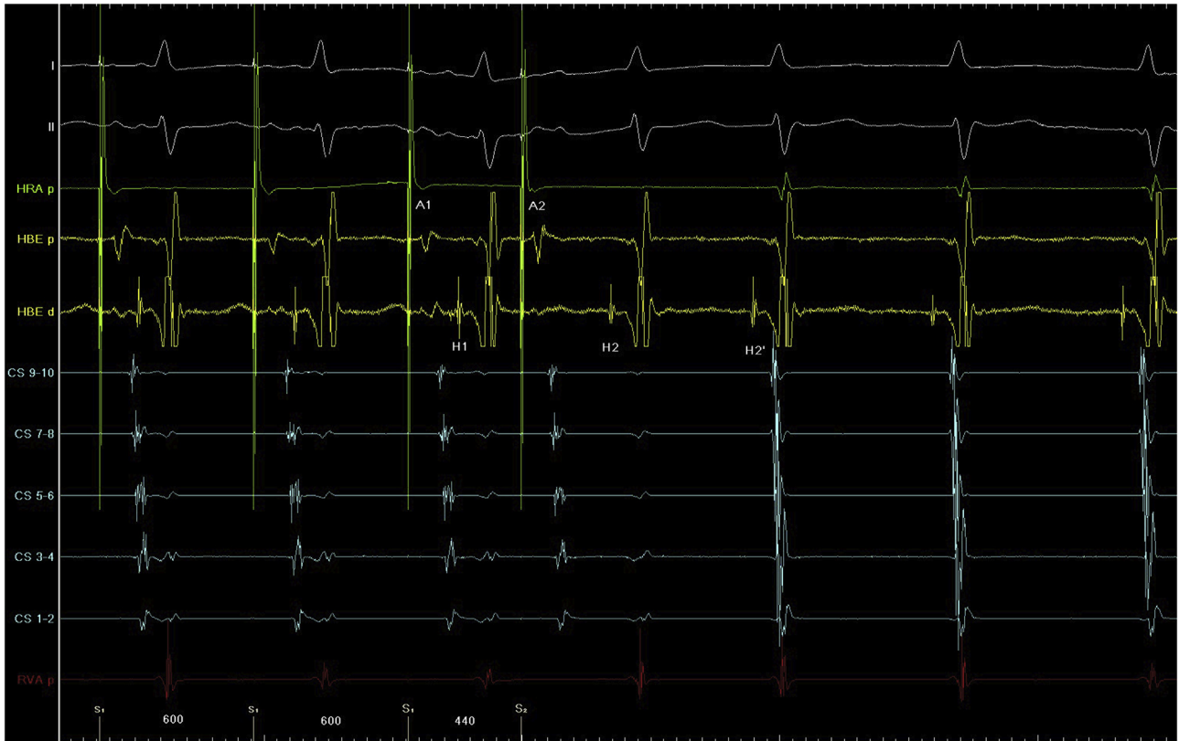
Fig. 3. Simultaneous conduction of an atrial extrastimulus (A2) over a relatively slow FP and a SP (A2H2 and A2H2' respectively) followed by induction of AVNRT with a CL of 750 ms. Electrograms recorded at a sweep speed of 100 mm/s. HRA, high right atrium; HBE, his bundle electrogram; CS, coronary sinus; RVA, right ventricular apex.