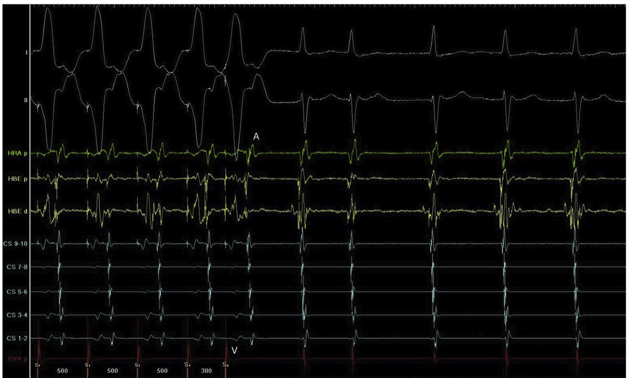
Fig. 4. Induction of AVNRT with programmed ventricular pacing: single extrastimulus with coupling interval of 380 ms and VA interval of 200 ms. Electrograms recorded at a sweep speed of 100 mm/s. HRA, high right atrium; HBE, his bundle electrogram; CS, coronary sinus; RVA, right ventricular apex.