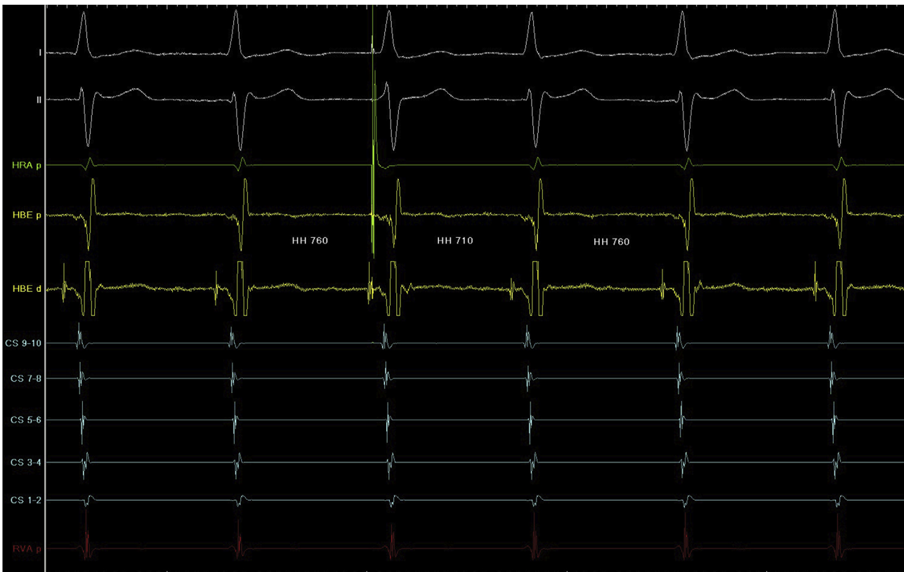
Fig. 2. In response to an atrial extrastimulus delivered during His bundle refractoriness (arrow) the subsequent His potential is advanced by 50 ms, pointing to AVNRT. The measurement in milliseconds are H-H intervals, with the electrograms recorded at a sweep speed of 100 mm/s. HRA, high right atrium, HBE, his bundle electrogram; CS, coronary sinus; RVA, right ventricular apex.