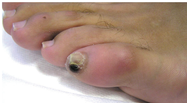
Fig. 1. Pigmented, slightly infiltrated lesion, oval in shape, brownish-black in colour, with poorly defined borders.

Dermatological examination revealed a pigmented, slightly infiltrated lesion, approximately oval in shape, 0.8 × 0.5 cm, brownish-black in colour, with poorly defined