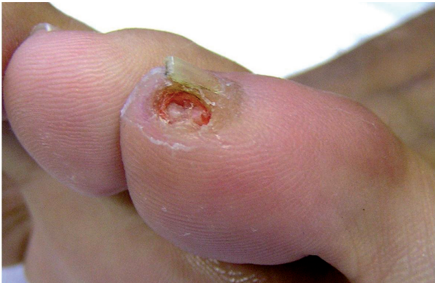
Fig. 3. The lesion was successfully removed by curettage.