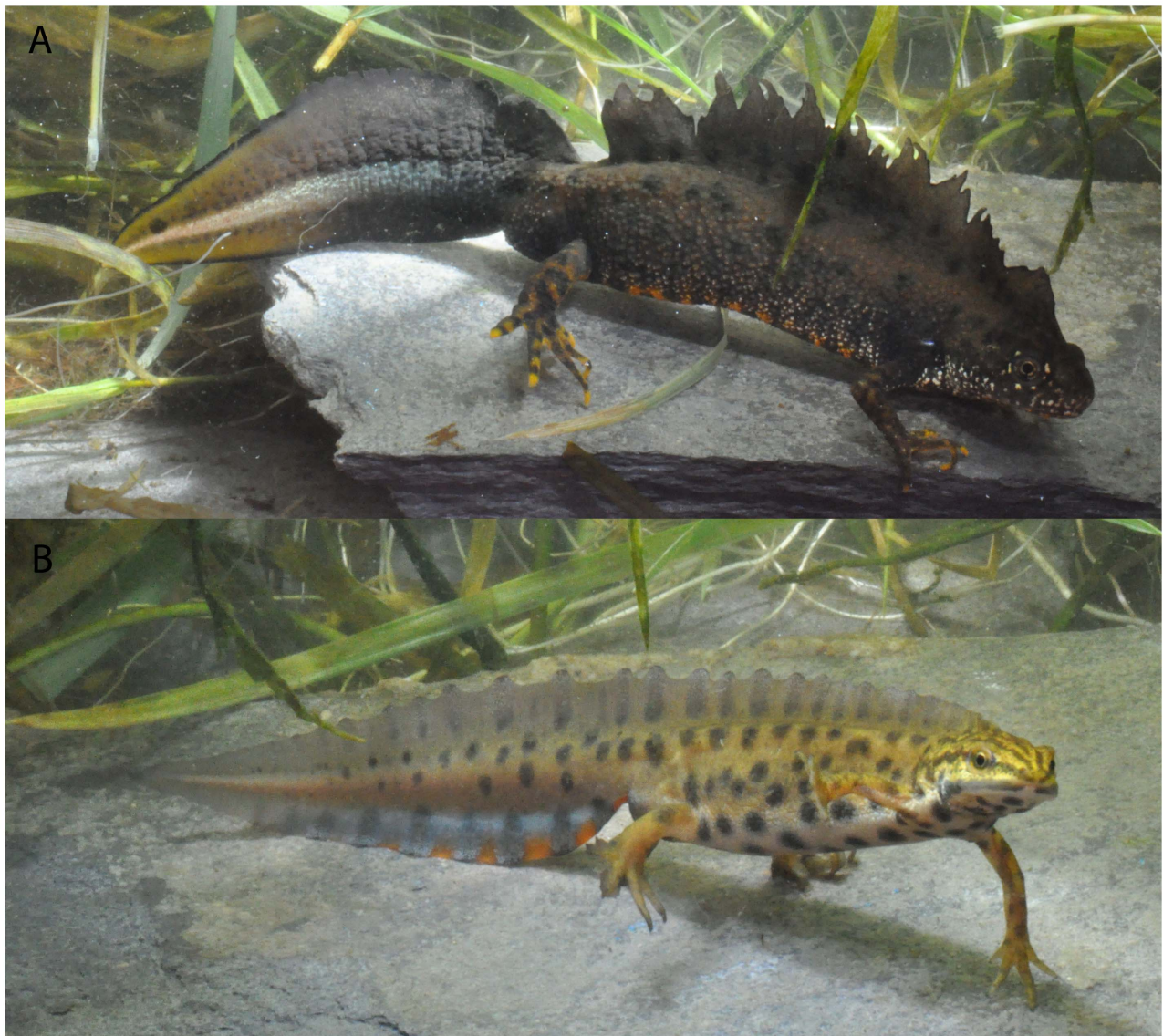
Figure 1. The crested newt ( Triturus cristatus ) (A) and the smooth newt ( Lissotriton vulgaris ) (B). Both pictures show males from a pond in Pays de Herve (Belgium) and are representative of a rare and emblematic (A) and a more common and less protected (B) species. doi:10.1371/journal.pone.0062727.g001

much rarer than the smooth newt. This pattern is typical of Western Europe, where modernization of agricultural practices and urbanization of natural lands has resulted in a decline of pond-breeding amphibians [26,27]. Therefore, this situation may be representative of very large areas of Europe in the near future. Two previous studies fit this pattern, but have suggested that new surveys targeting sympatric crested and smooth newts, including a larger set of variables, are needed to identify processes acting at various scales [22,23]. Specifically, a number of previous studies considered landscapes within a radius of 400–500 m from ponds, whereas finer-grain studies suggest that more detailed, shorter-range analyses may also be valuable [28]. Among the wide range of pollutants that are toxic to amphibians, laboratory studies have evidenced the risk of water pollution by nitrogenous compounds as found in fertilizers and urban water discharges [29], but until now no field studies have assessed their detrimental effect on newt distribution. This could be particularly relevant in periurban and agricultural areas dominated by cattle grazing. Past landscapes (i.e.