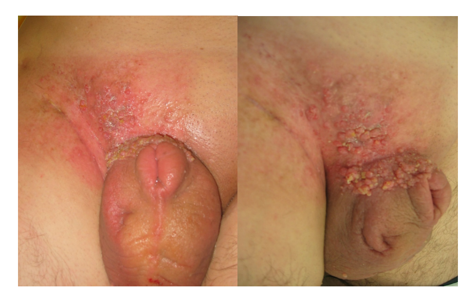
FIGURE 1 . Extensive angiokeratoma of the right inguinal region, penile shaft, and scrotum in the distribution of the previous radiotherapy treatment. Also note the scrotal lymphoedema and buried penis.