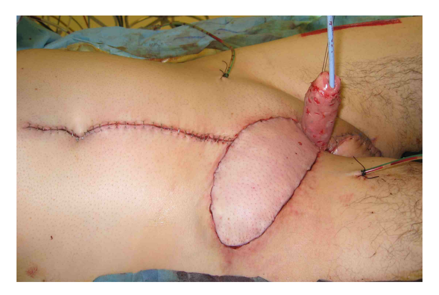
FIGURE 2. Replacement of diseased inguinal skin with a VRAM flap and penile shaft skin with a partial-thickness skin graft.