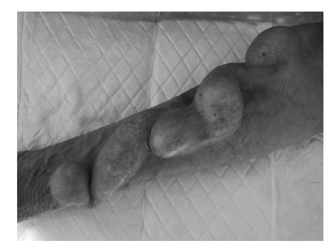
Fig. 4. A 10-year-old radiocephalic AVF: showing marked dilatation throughout but with excellent function and otherwise asymptomatic.

The risk of rupture of small stable aneurysms is low as they are thick walled and covered with skin. Clinical concerns are raised when an aneurysm presents with a rapid increase in size, pain, thinning and degeneration of the overlying skin and/or