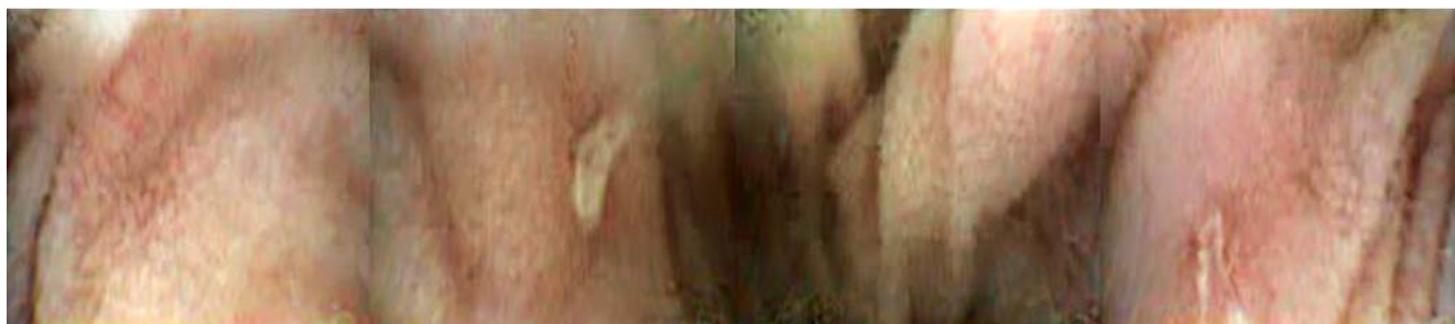
Fig. 1 Two superficial jejunal ulcers in the second and fourth quadrants.

mic 360° viewing with wire-free technology, longlasting battery life, and 12–20 frames per second captured by four high-resolution cameras located on the capsule sides and facing the four quadrants of the digestive wall [4,5]. To the best of our knowledge, there is no published report on the use of this new technique in patients with suspected small-bowel Crohn's disease. Here, the case of a 51-year-old woman with a 2-year history of chronic, nonbloody diarrhea is presented. Physical examination was unremarkable and laboratory parameters were within the reference ranges, with the exception