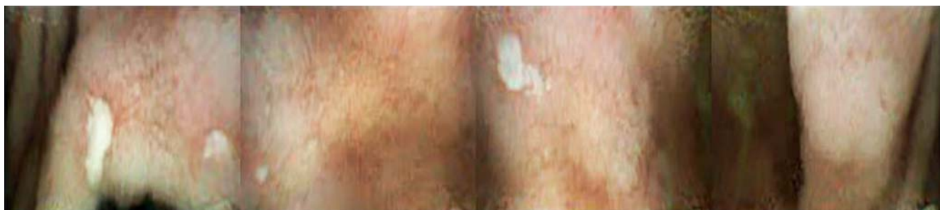
Fig. 2 Multiple superficial ulcers in the proximal ileum, quadrants 1–3.