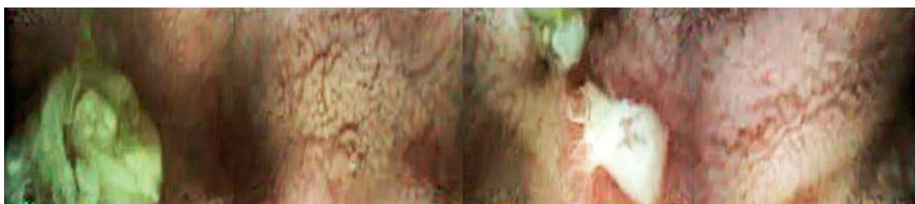
Fig. 4 Large and deep ulcer of the distal ileum (quadrant 3).