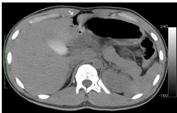
Figure 2 Repeated CT scan. A CT scan was repeated after the patient developed peritonitis. Peritoneal free air was detected (arrow).

Ten days later he was readmitted for fever and worsening lumbar pain radiating to the limbs bilaterally with minimal walking impairment. Blood exams revealed increased C-reactive protein (CRP) levels and leukocyte count. Abdominal CT scan showed no signs of intra or