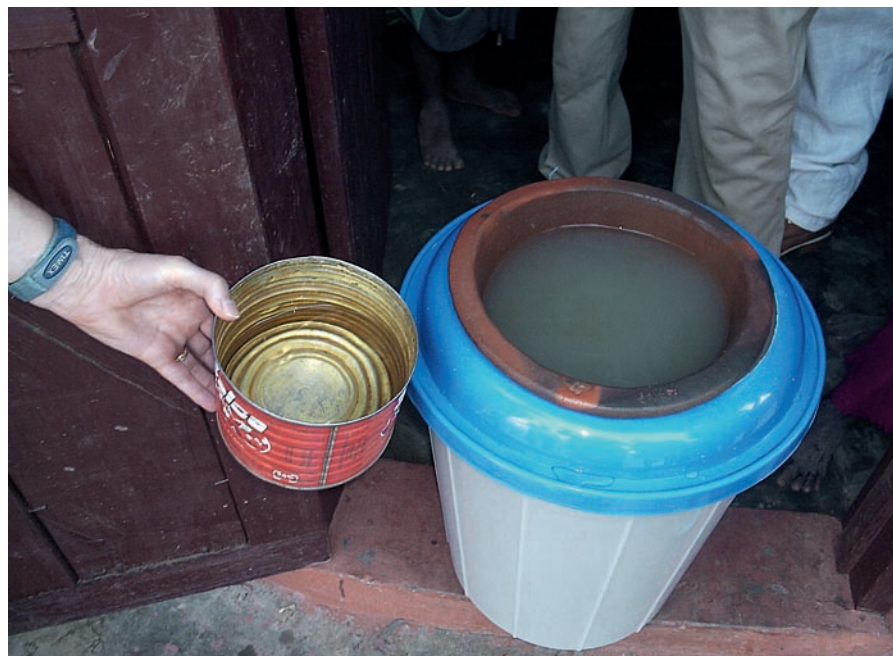
Fig 2 | The Kosim system. This consists of a ceramic pot filter that removes soil debris and microbiological contaminants from the water. The appearance of water from an earthen basin located in the Gonja District (Northern Ghana) is shown before (right) and after (left) the Kosim sanitation step.

One solution to the problem of water scarcity and pollution has therefore been the application of household water treatment and safe storage (HWTS) systems, which are a cluster of innovative, low-cost technologies developed by Murcott and her colleagues in non-governmental organizations: the Environment and Public Health Organization (ENPHO; New Baneshwor, Nepal), and the Centre for Affordable Water and Sanitation Technology (CAWST; Calgary, Canada). HWTS systems are simple, self-reliant and user-friendly, and can be used locally, such as the Kanchan arsenic filter (KAF) that is being used in Nepal, where arsenic and microbial contamination of drinking water pose a serious health problem. Murcott reported that the KAF reduces arsenic contamination by 85–90% and total coliform contamination by 85–99%; 7,000 of the 30,000–40,000 households identified as being affected by arsenic contamination are now using KAFs, and another 5,000 will install the system in the next year. This cheap household system is also being used in other countries around the world.