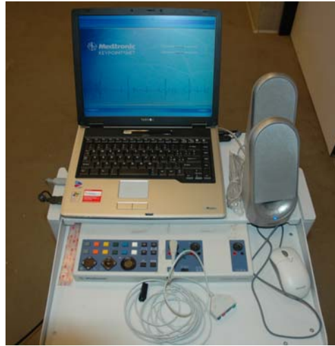
Figure 4 EMG Machine.

Keypoint® portable (Medtronic, Denmark) EMG machine connected to a laptop (fig. 4) with installed a dedicated software (Keypoint®.Net, Medtronic, Denmark) for visualization and subsequent analysis and storage of the signals.