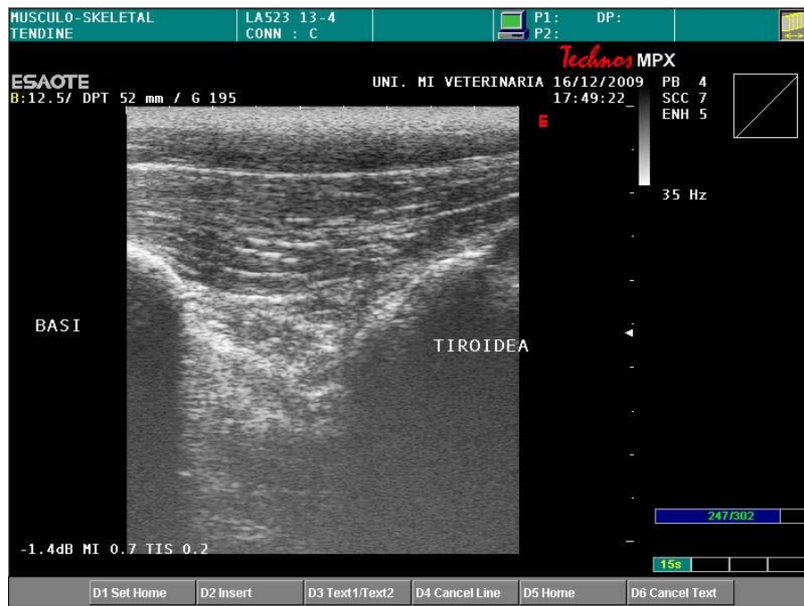
Figure 2: Midventral window

MHz convex (14-mm ) transducer. Is preferable to examine the horse restrained in stocks wearing a standard halter. The examination is performed with the horse unsedated; hair clipping is not generally required and alcohol is usually used as coupling agent. The authors described four acoustic windows: rostroventral, midventral, caudoventral, and right and left caudolateral. These are scanned on longitudinal and transverse planes for the ventral windows and in a longitudinal plane for the lateral windows. The rostroventral window is defined as the region between the rostral tip of the lingual process of the basihyoid bone and the body of the basihyoid bone. The midventral window (fig. 2) is defined as the region between the basihyoid bone and the thyroid cartilage and is identified in the longitudinal plane with the probe directly on the midline.