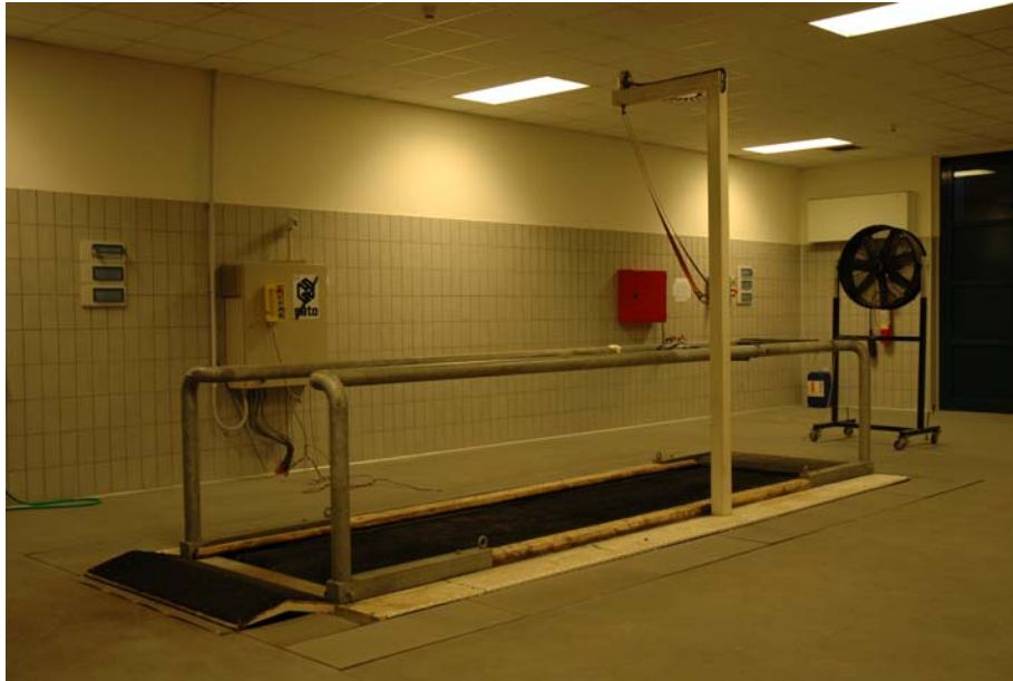
Figure 3: High speed treadmill in a dedicated room with controlled environment

muscles. Exercise tests were realized using an high-speed treadmill (SATO-I, Sweden). (Fig. 3).