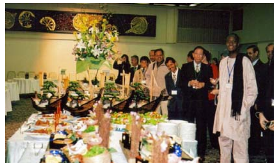
The conference dinner – a Japanese banquet

I also attended a meeting on "Collaboration on faculty development on quality assurance of LIS programs" that was held at the end of the formal conference. The need for this was driven by the SET studies on equivalence and reciprocal recognition of academic qualifications in LIS since 1977 and SET's current activities still include the problems of international reciprocity/equivalency of qualifications and LIS School guidelines. Participants were invited to explore the issue of quality as currently measured by LIS schools around the world, as well as how to provide support for promoting quality in LIS education and training. The fact that there were some 25 delegates present, representing the countries of Taiwan, Japan, Singapore, Malaysia, New Zealand, Australia, India, Kuwait, Vietnam, Hawaii, USA, Denmark and Thailand meant that there was some very useful exchange of current practice and plans for the future in LIS education. Since we all realised that we cannot always teach in the same way, I was left wondering just how useful measurement of "quality" and "equivalency" might be in such a varied world.