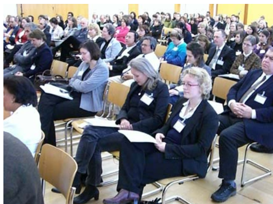
About 300 participants from all over the world: IFLA 3rd Presidential Meeting auditorium

manuscripts seemed to constitute a source of pride not only to the libraries containing them but to the librarians as well.