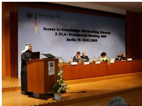
3rd IFLA Presidential Meeting: Focus on Islamic speaking countries