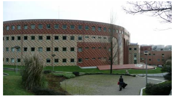
Faculdade de Letras, Porto, Portugal

connectivity to other disciplines and by providing more practical-oriented strategies.