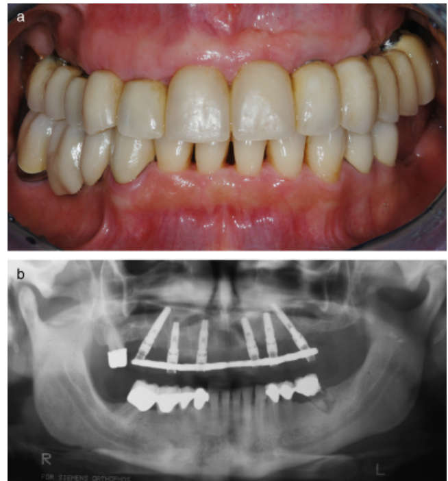
Fig. 2. (a) Immediately (48 h after surgery) loaded provisional prosthesis. (b) Orthopantomograph with metal-reinforced full-arch provisional prosthesis.

CE and FDA (Elite Implant Impression Material, Zhermack®, Badia Polesine, Rovigo, Italy).