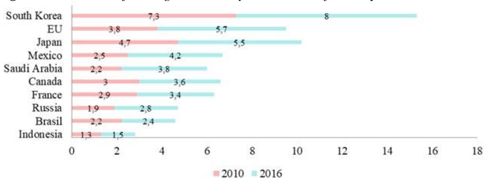
Figure 1. The share of the digital economy in the GDP of developed countries, %

It is fair to say that the practical implementation of the digital economy in the agricultural sector of the Russian Federation is hampered because it is explained by the following factors: