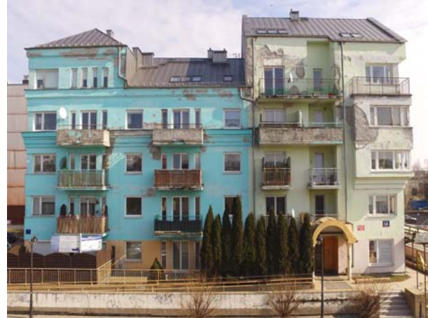
Unit 2 (balconies, heavy damaged)