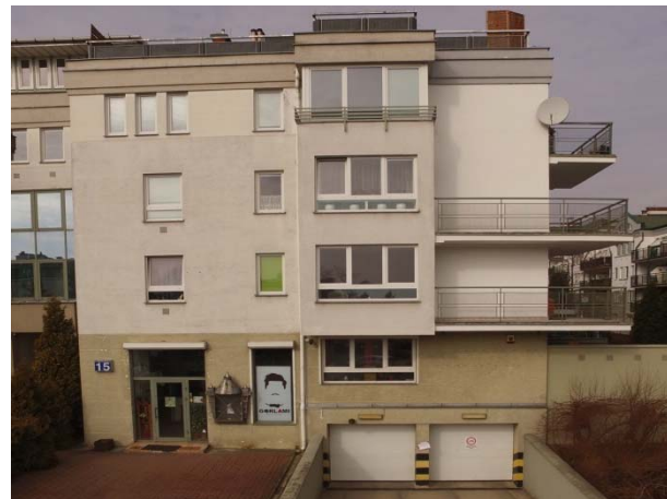
Unit 4 (balconies and tribunes, medium damaged)