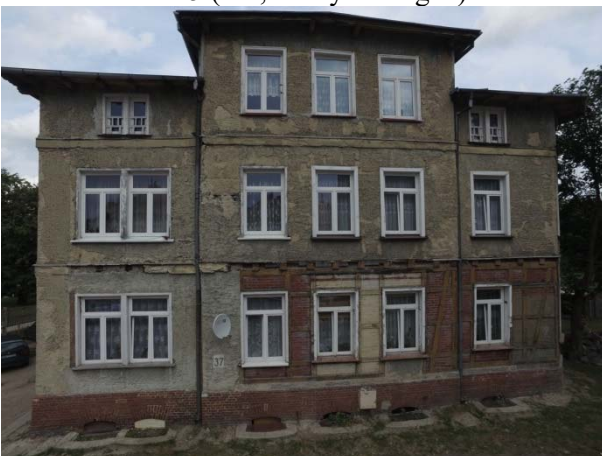
Unit 5 (flat, heavy damaged)