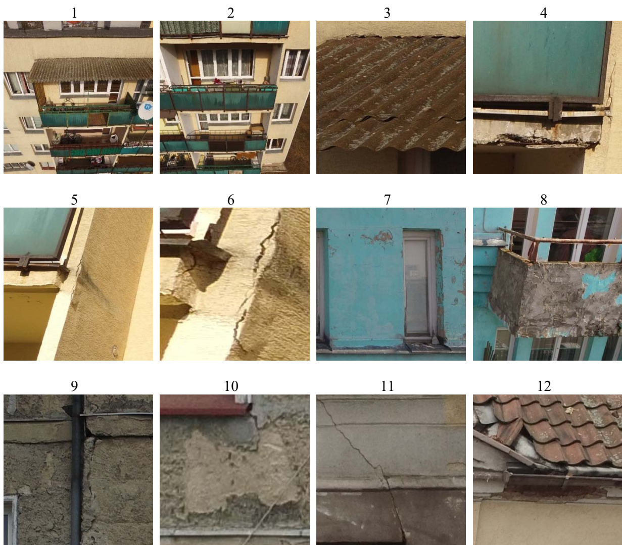
Figure 4. Selected images to illustrate different views of the facades and several injuries, extents and severities.