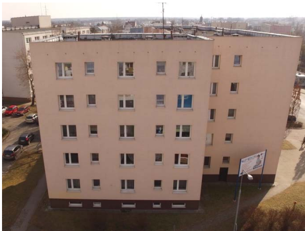
Unit 3 (flat, no damaged)