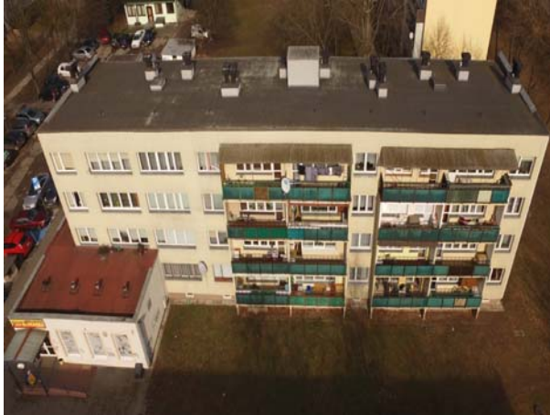
Unit 1 (balconies, slightly damaged)