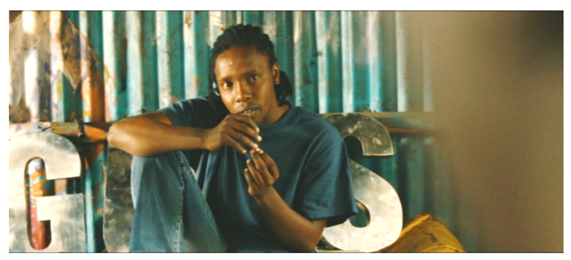
Figure iii: A medium shot of a member of Dingo's gang concealing the word 'GUNS' in Tosh Gitonga's Nairobi Half Life , (2012) (Source: screen freeze-frame).

The second part of Katumanga's concept, recompositing, thus vocalizes the opportunities which enable these characters to assemble into functional communities and the manoeuvres which make it possible to retrieve themselves. The take home from the shot and the scene is the idea of cunning economic reproduction systems codified in the framing and composition of the shack's rear wall (Figure iii).