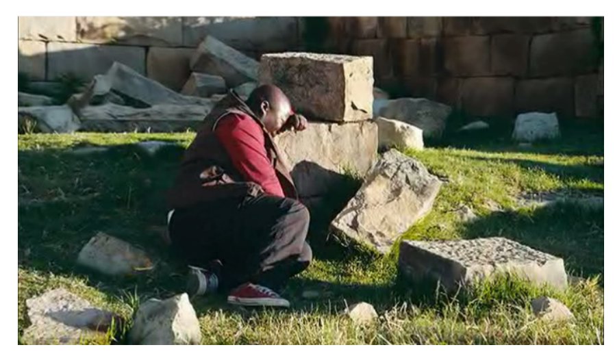
Figure vii: In this shot, Beast is shown as part of the abandoned building stones in Gray Hofmeyr's Mad Buddies (2012) (Source: screen freeze-frame).

What this image achieves is to inscribe the "transformation of the spectacle of ruination into the aesthetics of transience and becoming" (Foster J., 2008, p. 195), that is, to indulge in the temporal aspects of the transition from apartheid to post-apartheid to posit questions about the nature of this transition. What does the white and the black become in the new South Africa? What comes in place of the apartheid, or precisely, what occupies the place of the ruins of apartheid? Is it not the doctrines and believes that spurred the same practices before? These questions are not abstract ways of critiquing the image. They are pre-empted by yet another shot occurring moments after this one where the director uses close-up shots showing another ruin. But unlike the previous sequence (Figure vi) where the characters are separated from the ruin, the characters are framed as part of the second image of ruin (Figure vii).