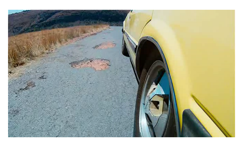
Figure iii: The exterior shot showing two potholes at the start of the slope in Gray Hofmeyr's Mad Buddies (2012).

In this shot, several elements are used. The most dominant is the car and the part of the tarmac road adjacent to the tire. The close-up exterior shot of the car moving beside the potholes framed from behind the left rear wheel visually balances the dented road and withering grass tufts on the left half of the screen with the car to the right. Both the car and the road share the screen size in almost equal vertical halves. In this way, such composition gives both elements equal prominence. There are some potholes framed at the centre of the screen, visually increasing their significance in the shot. Such composition style carefully juxtaposes the two symbols, the journey and the car, which metonymically connect to suggest the difficult journey being made by the protagonists. Furthermore, the landscape could as well be interpreted, by its barrenness, to suggest an inhospitable coexistence. Composing the roadside with withering grass add to this allegory of desolation and perhaps, futility.