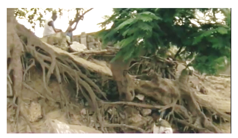
Figure iii: A medium shot of eroded roots in Maria João Ganga's Na Cidade Vazia , (2004).

Yet recent ease of transfer, starting with the paradoxical removal of Roque Santeiro market from the city show the citizens' reducing interest to cling to the city. Seeing this huge market as "a gigantic waiting room" (Tomás, 2012, p. 3) for residents and traders gives shape to a pervasive conversation of temporality. Residents making a living in the market do not enjoy tenure of residence. Their precarious sense of belonging is implied by the opaque terms of their occupancy. In the same way, persisting musseque imagery in a political climate where eviction - not necessarily accompanied by a relocation - is almost guaranteed, forms a language of temporality. The social categories imbued on the city's residents are embedded, first, on their materiality. In this section, I read material temporality by referring to Ganga's metaphor of susceptibility embedded in this image of eroded roots (Figure iii).