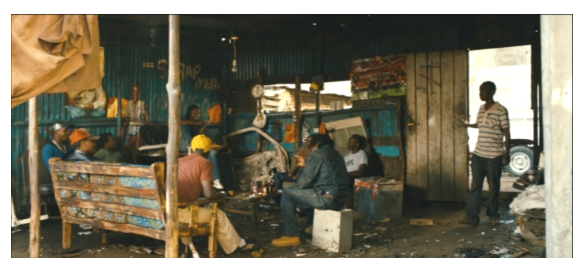
Figure i: A long shot showing Mwas arriving at Dingo's place in Tosh Gitonga's Nairobi Half Life , (2012).

While making such a space the main setting in the film makes serious commentary about the city's mixed political economies, the biggest utility is that it enables the story of this marginalized community to be at the fore of the film. Thus, the choice of a junkyard and the words 'scrap metal' written near the furthest corner of the iron sheets of the rear wall advertising the place as a salvage yard alerts the viewer to another covert discourse at work. Identifying the shack (an object fashioned through the accumulation of the city's waste) as a scrapyard, the place where "material refuse of civilization" (West-Pavlov, 2005, p. 42) is curated into useful objects, counters the obvious disdain against the community of crooks inhabiting the space. Here is a place where the city's rejects achieve new value, new usage, new narrative material. The idea of utility is fully developed through the interaction of characters with the materials within the space. The old sofas are now re-used as seats, the old iron sheets are erected as new walls and the crooked poles are now support-columns of the shack. By re-using these pieces of junk, Dingo's shack expresses how salvaged objects