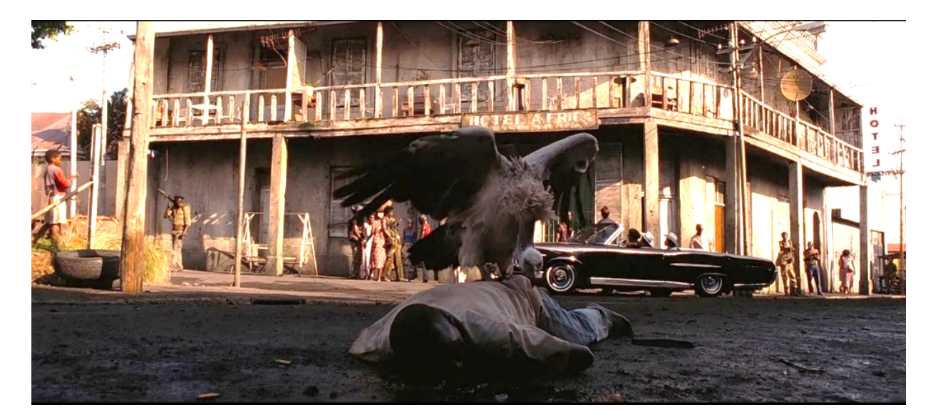
Figure i: A wide shot of a vulture landed on a corpse outside a street of Monrovia in Lord of War (2005)..

This shot shows a corpse lying on the foreground and a group of people standing around the huge building which dominates the whole background. A vulture stands on top of the corpse whole the people go on with their business, undisturbed. Among these people, some are armed, and others appear to be civilians. The cinematography uses shadows and light to demarcate the foreground and the background. Whereas the corpse is in the dark foreground, the people are in the brightly lit background. Most of the other space in the scene, the streets, are deserted. If we read this scene as a continuity of the initial sequence where the young boy is fatally shot, then this shot signposts Monrovia streets as "the scene of the crime" (Seltzer, 2003, p. 62) alluded to in that sequence.