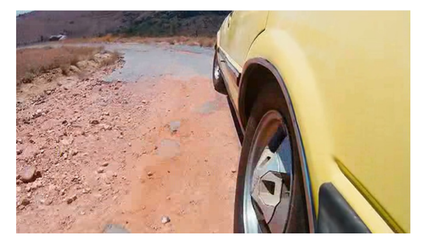
Figure v: A close up shot showing the deteriorated road in Gray Hofmeyr's Mad Buddies (2012) (Source: screen freeze-frame).

Visual emphasis on the potholes, achieved by medium close-up framing, aptly orients the viewer's attention towards increasing flaws. In respect to the idea of racial coexistence to which the journey is emblematic, one may argue that such a montage is a tribute to the exacerbating race woes in post-independence South Africa, as well as a crucial symbol of instabilities that the past infuses on the present. Lowering the camera is to show these surface flaws moderates the government-sanctioned effort to sanitize racial repulsion. Their existence on the road surface progressively signal defacement and abandonment and highlight the film's unease with choreographed coexistence.