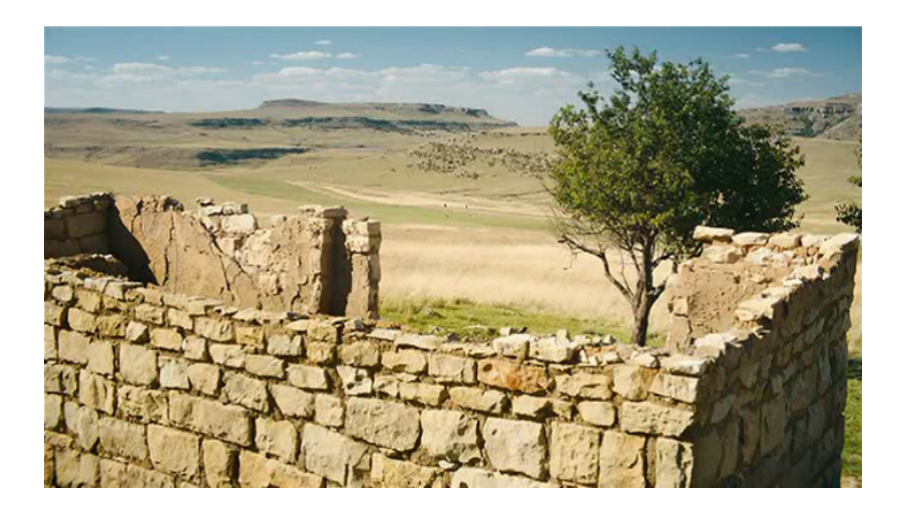
Figure vi: The shot of ruins in Gray Hofmeyr's Mad Buddies (2012).

Foster draws attention to the symbolism of the abandoned ruin as a signifier of the discourse of racial conquest that has dominated South Africa's landscape for centuries. The Boers and the European settlers would encounter each other in the landscape and their wars would produce a legacy of a landscape full of ruins. In this image of a scrappily built, incomplete and abandoned house, the film cultivates the idea of incompletion which can be read as a code of the inherent discourse of macro-apartheid that I discuss all along.