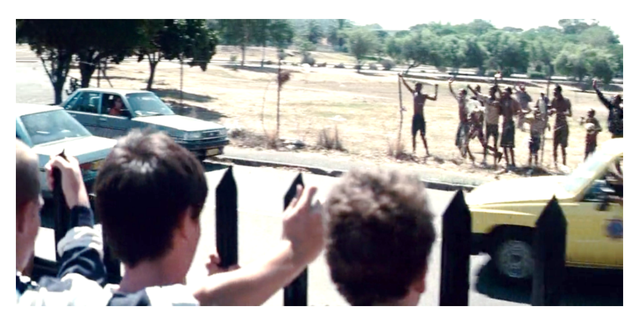
Figure i: The crane shot of the youths leaning on their fences as Mandela's convoy passes along the street in Clint Eastwood's Invictus , (2009)

titles complement the mise-en-scène (Figure i) composed to show two races existing side by side and hence articulates the political imagination of space typical of the apartheid South Africa.