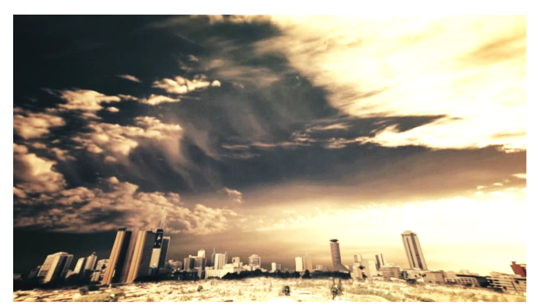
Figure vi: the last shot of the wide composite of Nairobi's slums and the city center in Muchiri Njenga's Kichwateli , (2012) (Source: screen freeze-frame).

place. The omission signals the film's intention to counter visibility with invisibility, regeneration with marginality and power in the city with defeat. The agitation imbued upon the scene by focusing on the storm and the erasure of the slum indicates that for the edge to survive, it must do so in innovative and unobvious ways. As both Njenga and Gitonga indicate, city films have the tendency to imagine the edge as a worthless space.