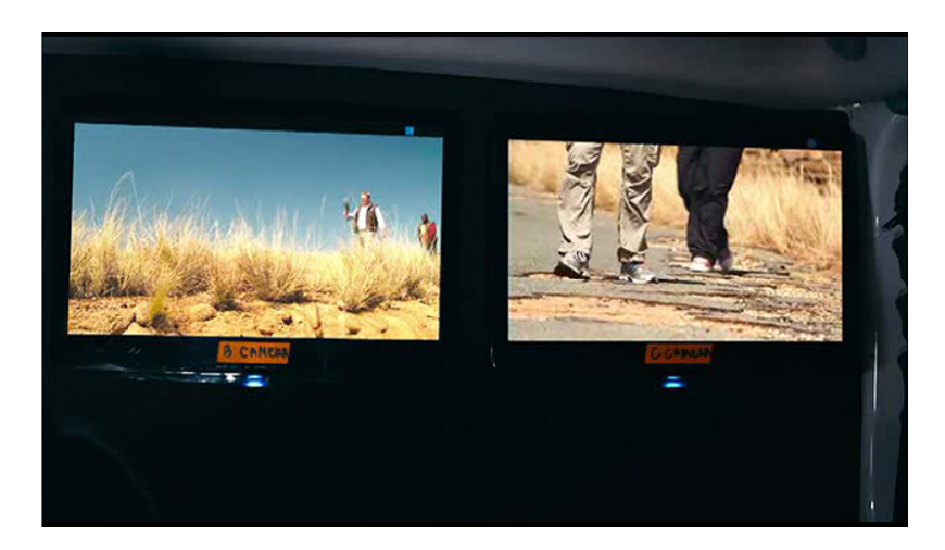
Figure ii: The first shot of the sequence framed to show two camera monitors inside the transmission van in Gray Hofmeyr's Mad Buddies (2012).

composition hides the closer details of the road surface to achieve what seems to be choreographed, therefore subjective, view of the journey.