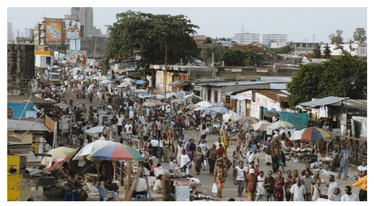
Figure i (left): A high angle long shot showing characters walking along a street in Kinshasa in Djo Tunda Wa Munga's film, Viva! Riva (2010). (Source: screen freeze-frame).

frame from the street scene, for instance, it is noticeable that what appears as an attempt to capture an authentic image of Kinshasa's edge certainly bears a covert yet clear analogy with the current national flag of the Democratic Republic of the Congo. Here I want to demonstrate the possibility of reading this shot in relation to the symbolism of the flag with the aim of showing how the street image is being used here to nurture the image of a pariah cité - a space where those unfit to dwell in the main city of Kinshasa create their own version of the city outside the main city. I make these arguments to demonstrate that it is possible to interpret the shot within the symbolism of the country's national flag and by doing so, also develop an analogy between the political discourses stashed within the flag's symbolic use of colour and the filmic language as used here.