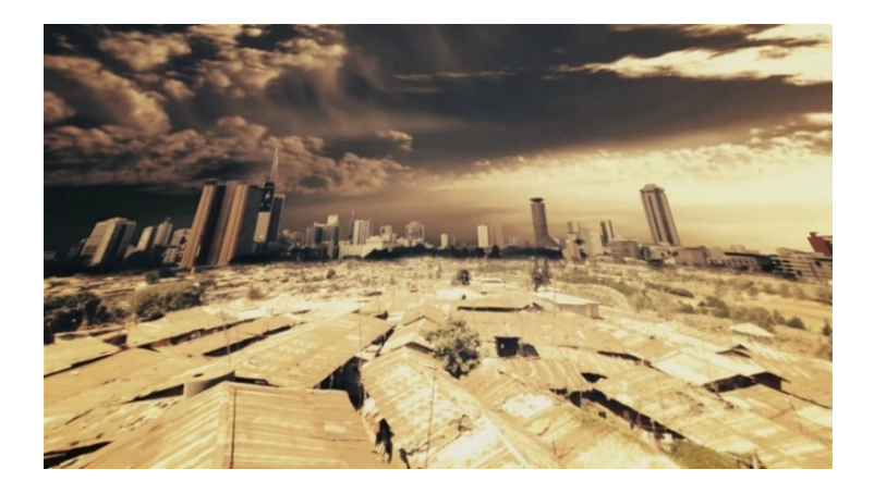
Figure iv: A wide composite shot of Nairobi's slums and the city center in Muchiri Njenga's Kichwateli , (2012) (Source: screen freeze-frame).

First, that the shot blends the slum with the main city without losing the informality of the former and vibrancy of the latter expresses the paradox of a marginal city reclaiming visibility (Gilderbloom, 2008). Njenga tucks the city's modern skyline behind the decayed slum, taking on an interventionist approach that disrupts the tendency to efface the slum to show a modernist façade as the 'real' African city. By positioning the slum in the foreground, he guides the viewer to see it as both a "periphery', but also as a 'forefront' – a starting point" (Rahamimoff, 2005, p. 69) for understanding contemporary spatial intersections typical of Global South cities. By this reasoning, the composition which immediately provokes the viewer to think of the shot as a reversal of the expected city gives hypervisibility to the slum. It thus toys with the idea that the city's centre - edge pattern. The shot can be interpreted as a shorthand for the ubiquitous nature of urban distress. It is important to note that the slum extends beyond the foreground and by this strategy engulfs the viewer within its vastness while also concealing its borders speaks of a continuation rather than encroachment on the city's margins. In this sense, it is not just an alternative city space, but the 'real' face of the city (Pieterse, 2011). The indigent foreground and the rich background signal the city precincts and the rise of its excluded edges as the new centre.