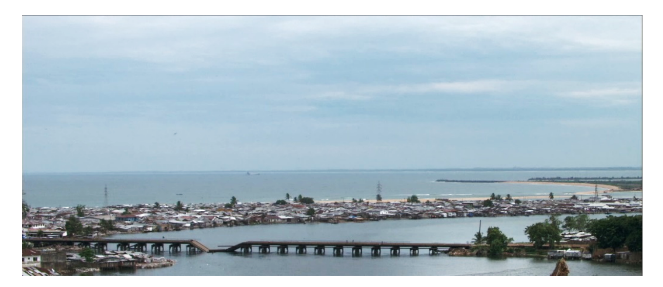
Figure iii: A wide shot a broken bridge in Johnny Mad Dog (2008).

To speak of Monrovia using the metaphor of chasms is to invoke the political, social and economic trauma carried over from years of carnage, insurgencies and prolonged war. When these post-war narratives are retold in Johnny Mad Dog , the contrasting and divergent prospects that political personages and ex-combatants face within the city are at the centre of the image of post-war citizenship in Monrovia. Johnny Mad Dog uses street symbols to frame disconnection between spaces in Monrovia. From its start with violent incursions into Monrovia - a city prized for its inherent symbolism of authority and power – which are portrayed as symbolic journeys into political, ethnic and economic inclusion; to a resolution that intimates of contiguity of betrayal and dispossession, this film presages disconnections between places, ethnicities, political groups and socio-economic classes. These are presaged by, among other symbols, the imagery of a broken bridge (Figure iii).