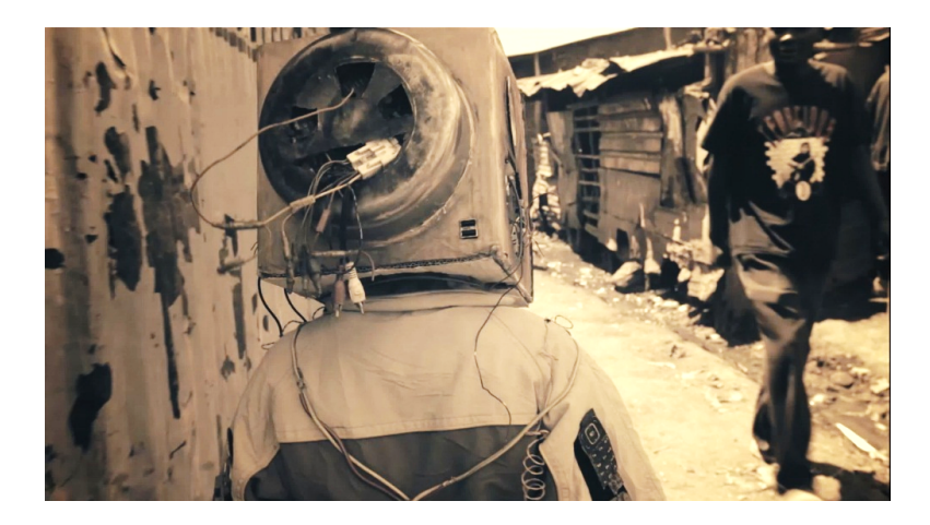
Figure ii: A photo showing the protagonist's TV head made from reclaimed junk in Muchiri Njenga's Kichwateli (2012).

counter their degradation by connecting to form a new bricolage project, the shack, that can provide new use, meaning and camouflage to the city waste. On his part, Njenga uses an old reclaimed analogue TV head (Figure ii) to show renewal.