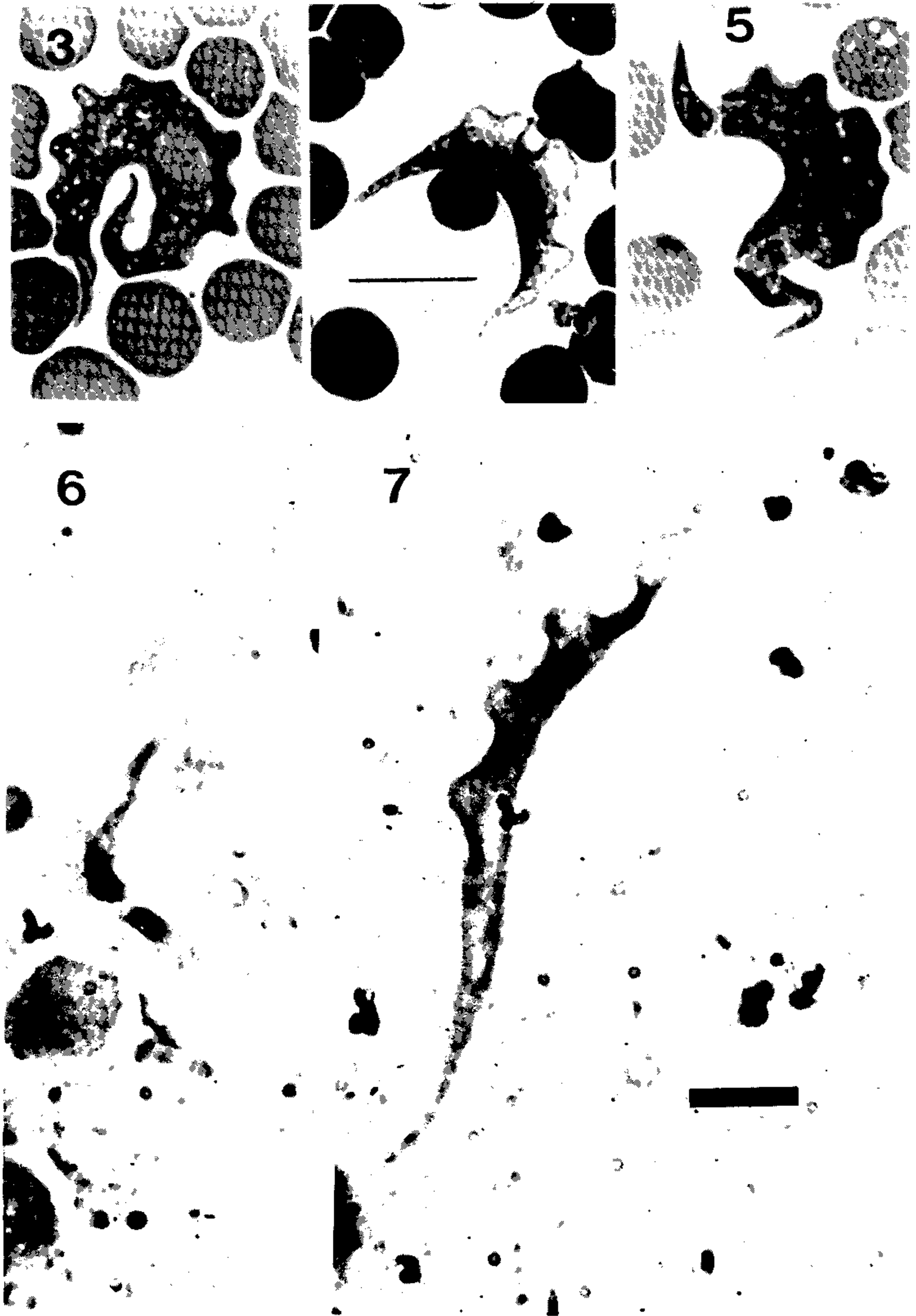
Figs 3-5: Trypanosoma peba , n. sp., in the blood of Euphractus sexcinctus . Giemsa. To same scale. Bar in Fig. 4 = 10 \mu m. Figs 6-7: Trypanosomes in impression smears of subcutaneous lymph nodes of Dasypus novemcinctus . Giemsa. To same scale. Bar in Fig. 7 = 5 \mu m.